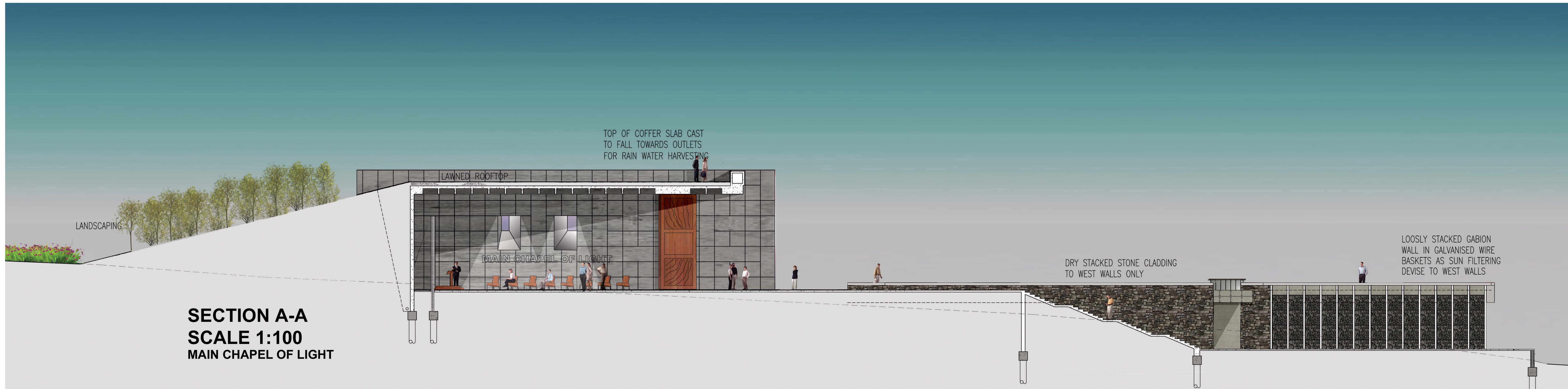
SECTION A-A SCALE 1:100 MAIN CHAPEL OF LIGHT