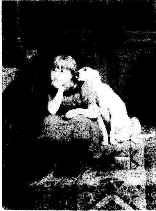
Breton de la Rivière. Sympathy. Oil on canvas, 1871, in the collection at the Royal Holloway and Bedford New College, University of London, Egham, Surrey (Rowan, 1988:124)