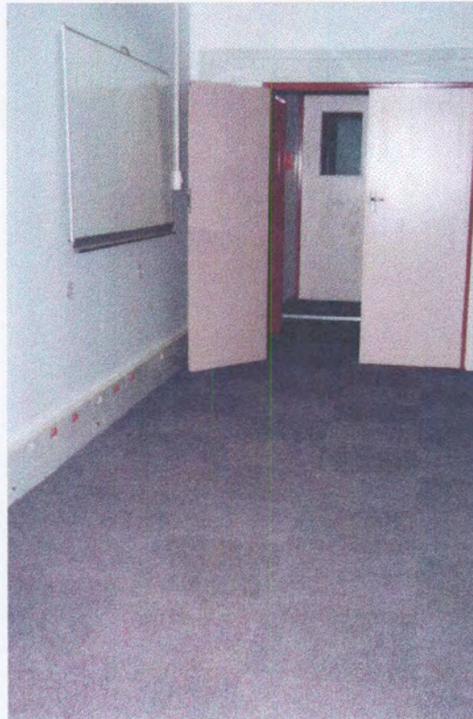
Plate 5.1: The dog approach area as seen from the subject's seat