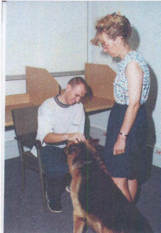
Plate 5.2: A posed example of a model touching the dog at the end of the dog approach