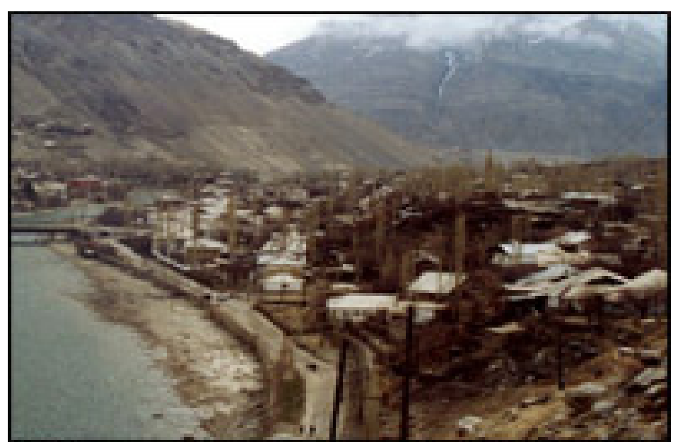
Khorog, Capital of Gorno Badakhshan Oblast

In Tajikistan, one of the poorest countries in the former USSR region, the IFC and the Aga Khan Fund for Economic Development (AKFED), together with the Tajikistan government, are working on the development of a new electricity generation and distribution project in Gorno-Badakhshan region for 250,000 residents. A new company was established, 70% owned by AKFED (a group of private, non-denominational development agencies) and 30% by IFC. The project will cost US$ 26 million. In addition, the Swiss government provided US$ 5 million to maintain the tariff increase required in the early years in line with the national tariff and to support a minimum consumption amount. The company will control and operate all existing electricity generation, transmission and distribution facilities in Gorno-Badakhshan under a 25-year concession, complete with a partly constructed hydroelectric plant but increasing its capacity from 14 MW to 28 MW. It will also operate another 8 KW plant in the city of Khorog and construct a river regulating structure at the upstream Yashikul Lake to ensure adequate flow in winter, and rehabilitate other assets, including substation, transmission and distribution lines.