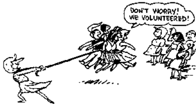
Gonick & Smith (1993, p.97)

“Small-scale surveys often resort to the use of non-probability samples because, despite the disadvantages that arise from their non-representativeness, they are far less complicated to set up, are considerably less expensive, and can prove perfectly adequate where researchers do not intend to generalize their findings beyond the sample in question” (Cohen & Manion, 1994, p. 88).