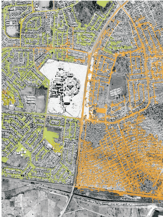
Figure 131 Area map scale NA Location plan 1:6000 scale