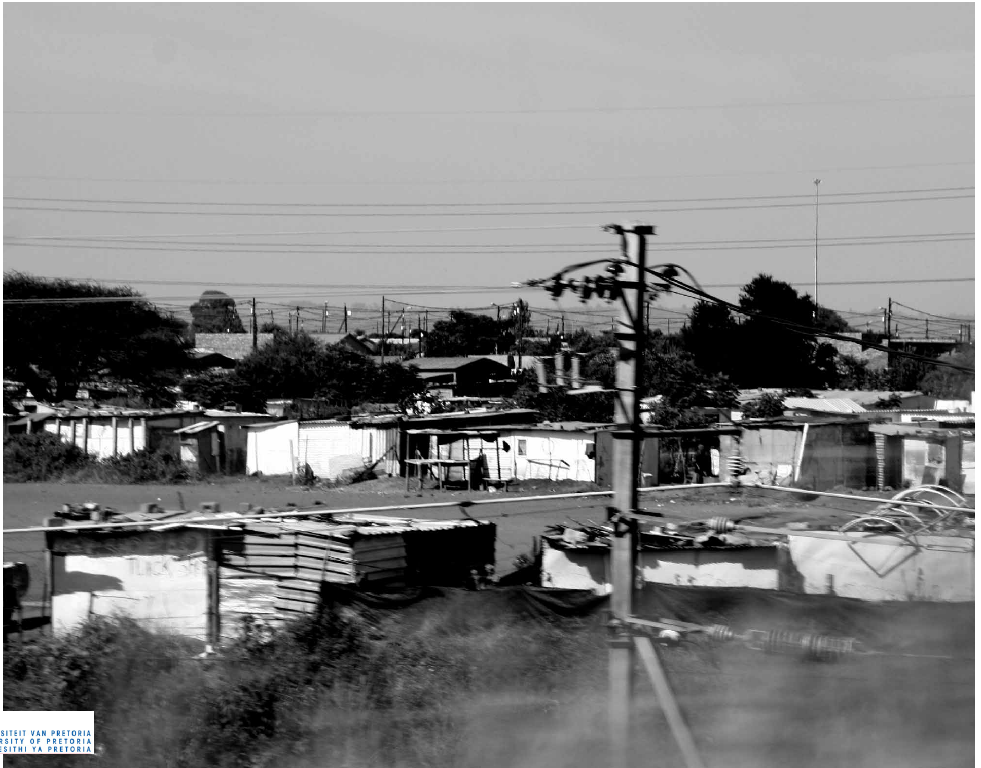
Figure. 1 Mamelodi