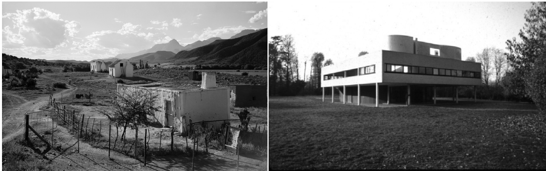
Figure 1.1. Left: Cape vernacular architecture (Fagan, 2012b). Right: Villa Savoye (1928) at Poissy by Le Corbusier representing the epitome of Modern Movement expression (Author, 1989).

The domestic architecture of Gabriël (Gawie) Fagan, an architect based in Cape Town, South Africa, is a unique heterotrophic 1 synthesis of the principles of Cape vernacular architecture 2 and Modern Movement 3 (see Fig.1.1) attitudes to function and space making, following a 'regional-modern' 4 architectural education. It forms a new architectural language that expresses mediated typological transformations of its informants.