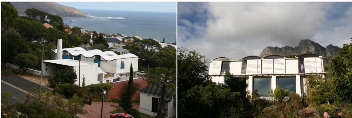
Figure 1.2. Die Es, Camps Bay, Cape Town (1965): street and garden views (Author, 2009).

For me it is always a breath of fresh air- and a jog - to my conscience to come out and see what you have achieved, I would have to go a very long way to see a finer main living space or standard of individual craftsmanship in such smaller things as the closet doors, etc.