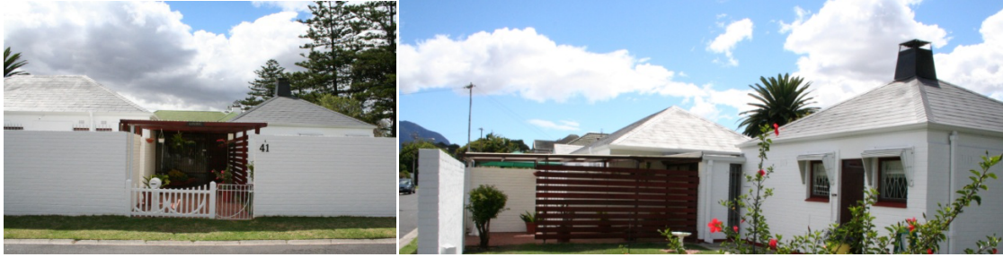
Figure 1.4. No. 41 Milford Road, Plumstead (Author, 2010).

The author's interest in Fagan's architecture was sparked by a childhood experience of growing up next to a 1960s painted brickwork box house in Plumstead, Cape Town (see Fig. 1.4). The enduring tectonic qualities of rough white walls, quarry tiled floors and a display of introverted and extroverted spaces was in stark contrast to the surrounding suburban blight. A love of Cape architecture was also instilled by my mother 28 who pointed out buildings in the city and who took me on trips to Cape vernacular buildings, particularly in Stellenbosch and Cape Town. Here, at around 12 years old, I captured elements of this architecture on my first instamatic camera (see Fig. 1.5). These influences have remained ever present in my architecture. The enduring legacy of building and its close relationship to place and the tectonic, visual and spatial qualities of Cape vernacular architecture still, to this day, provide stimulation for new designs and research.