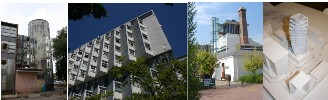
Figure 1.3. Other Fagan works. From the left: Volkskas Bank in Roodepoort (1959) (Author, 2008), Men's Residence (Helshoogte) Stellenbosch University (1970) (Author, 2009), Newlands Brewery alterations and additions (1993) (Author, 2009), model of a proposed tower block for the Fagans, Bree Street (2010) (Author, 2010).

The oeuvre of Fagan's architectural work is broad and extensive, ranging from conservation projects to new work and domestic to commercial and institutional buildings (see Fig. 1.3). The first twelve years of his career were spent as in-house architect for the then, Volkskas 27 Bank, designing and building new bank buildings and making alterations to existing structures. Conservation projects, including the restoration of main street Tulbagh after the earthquakes of 1969 and the Castle in Cape Town, form a large part of Fagan's work. Hostels, university architecture and commercial work are interspersed with seminal domestic buildings. These houses span Fagan's entire career and therefore present a continuum of work that can be critically analysed in terms of time-place, place-form responses (Frampton, 1992a:4) and formal and functional patterns.