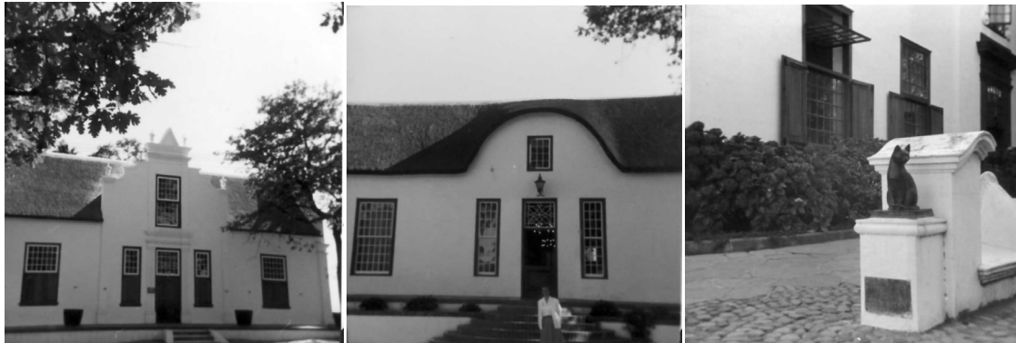
Figure 1.5. Photographs taken of Cape vernacular buildings in Stellenbosch.

The author's interest in Fagan's architecture was sparked by a childhood experience of growing up next to a 1960s painted brickwork box house in Plumstead, Cape Town (see Fig. 1.4). The enduring tectonic qualities of rough white walls, quarry tiled floors and a display of introverted and extroverted spaces was in stark contrast to the surrounding suburban blight. A love of Cape architecture was also instilled by my mother 28 who pointed out buildings in the city and who took me on trips to Cape vernacular buildings, particularly in Stellenbosch and Cape Town. Here, at around 12 years old, I captured elements of this architecture on my first instamatic camera (see Fig. 1.5). These influences have remained ever present in my architecture. The enduring legacy of building and its close relationship to place and the tectonic, visual and spatial qualities of Cape vernacular architecture still, to this day, provide stimulation for new designs and research.