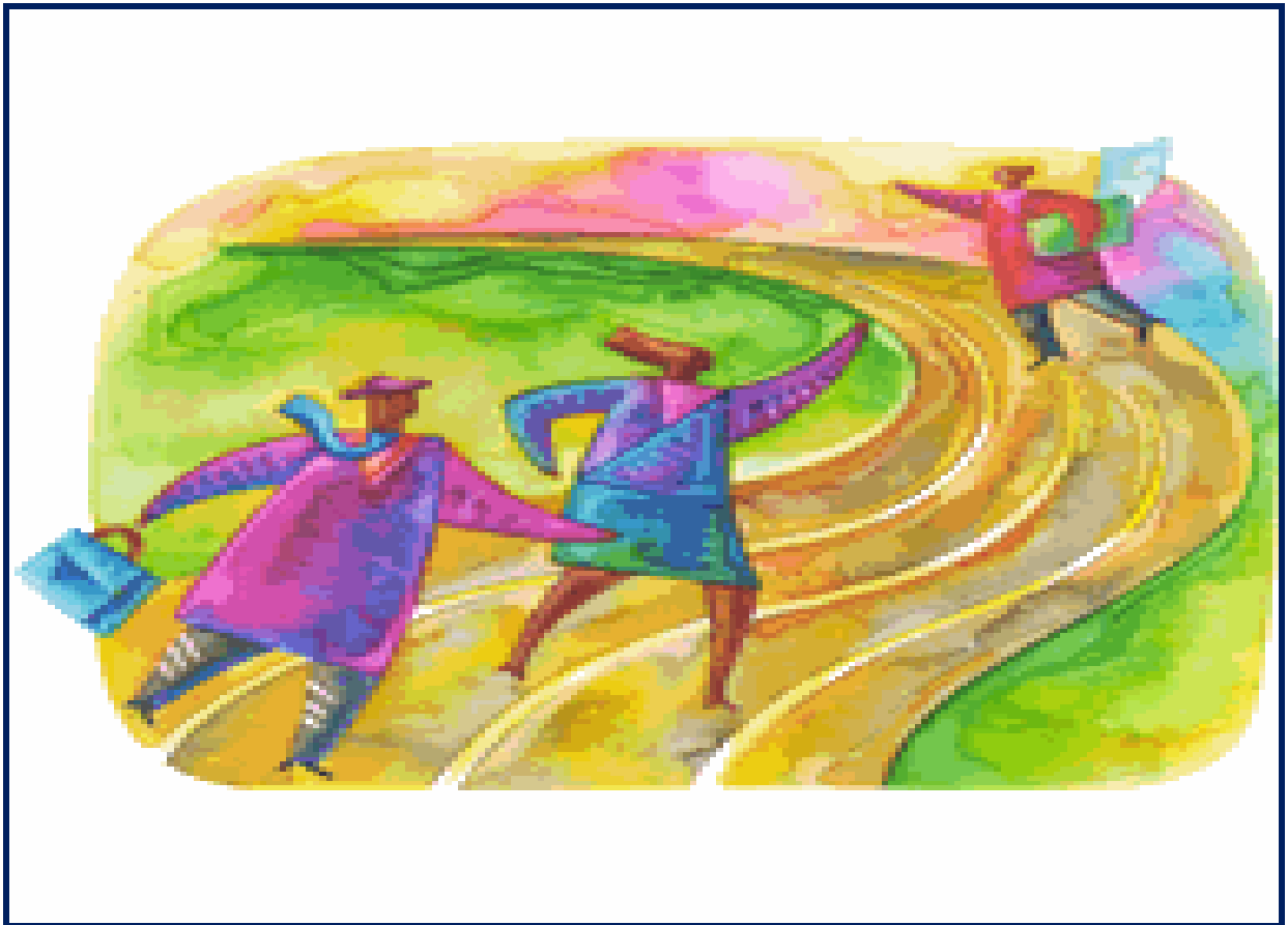
Figure 3.1: Concerns-Based Adoption Model Road Map (Adapted from WestEd 2000:11)

destination, who are at different points on the journey, with some well advanced, some in the middle while others are at the starting point as indicated in Figure 3.1.