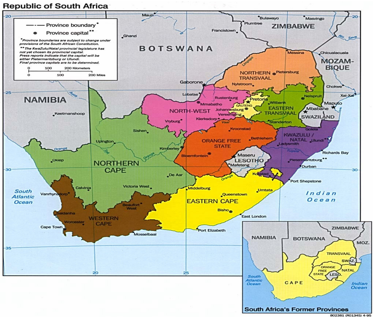
Map 1.2 Map of South Africa