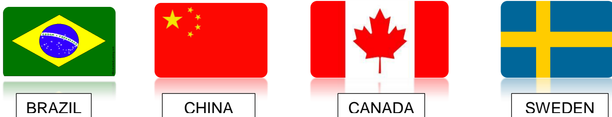
Figure 3: Countries using the transfer tax alternative

Before the alternatives introduced by Brazil, China, Canada, and Sweden are examined, it should be noted that the examination will be limited to the transfer tax consequences for resident individuals (the deceased person and the recipients of property) of the relevant countries. Additionally, in dealing with the transfer tax consequences for the aforementioned residents, the administrative aspects will only be considered to the extent that they are relevant when considering the advantages and disadvantages of using transfer taxes to replace death taxes.