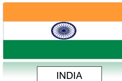
Figure 2: Country using the net wealth tax alternative

Before the alternative introduced by India is examined, it should be noted that the discourse in this study will be limited to the net wealth tax consequences that arise because of death. These consequences will be considered only for the following residents: the deceased person and the recipients of assets and income of the deceased. Additionally, in dealing with the net wealth tax consequences for the aforementioned residents, the administrative aspects will only be dealt with to the extent that they are relevant when considering the advantages and disadvantages of using the net wealth tax to replace death taxes.