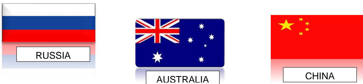
Figure 1: Countries using the income tax alternative

Before the alternatives introduced by Russia, Australia and China are examined, it should be noted that the discourse in this study will be limited to the income tax consequences