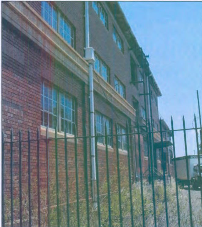
Figure 32: North elevation of block B

Access was constantly denied and drawings not available of block B. The building was previously owned by the Trigonometrical Survey Department (figure 32). It is a three-storey building in physically sound condition. It is expected to have the same architectural qualities (volumes, plan and construction material) as the three storey buildings of D and C. The building was previously used for administrative purposes and if repartitioned could accommodate the Pretoria Technology Park Museum. This museum will display information relating to the history of the Pretoria State Garage and its effects to the neighbouring sites. The total surface area of this block is not known but estimated to 1500m 2 , which could be used entirely for the park museum.