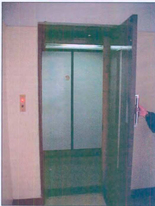
Figure 14: Lift in building D1

Figure 14 illustrates a lift located on the eastern side of D1 that does not comply with present building regulations and certainly unfavourable for the image of the administration building. Both blocks C1 and D1 require new installation of lifts and elevators, incorporated within a new spatial design.