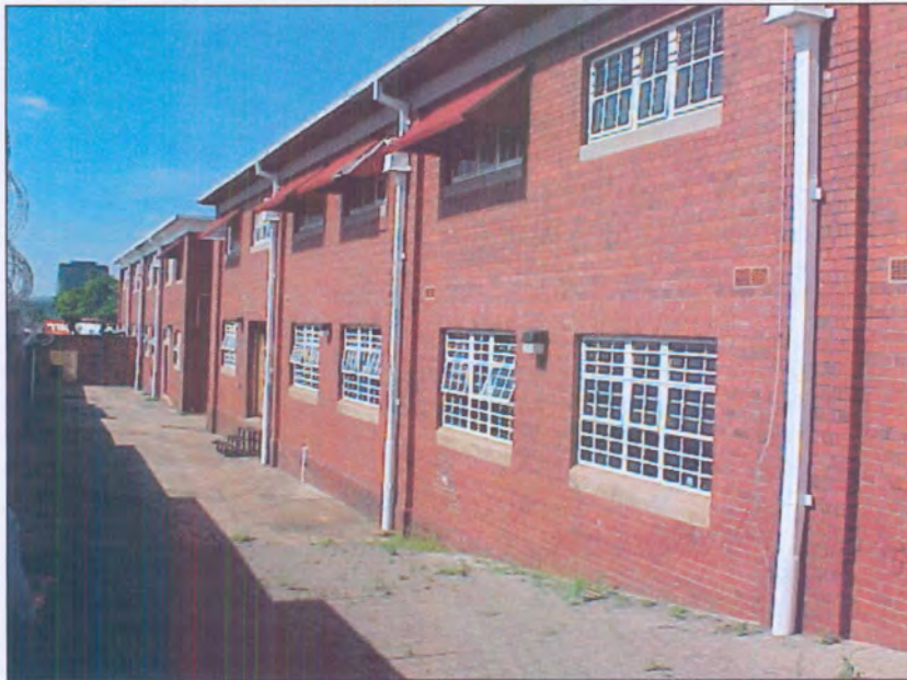
Figure 34: West elevations of K1 and L1

The first floor of K1 (remaining) and block L (Units L1, L2 and L3) offer a total of 4190m 2 for accommodation of tenant companies.