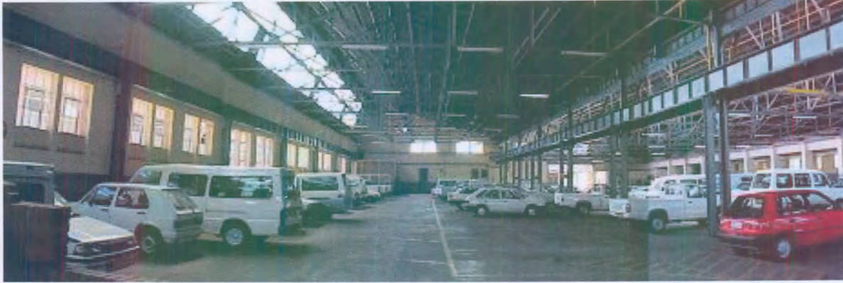
Figure 31: Unified interiors of D1, D2 and D3