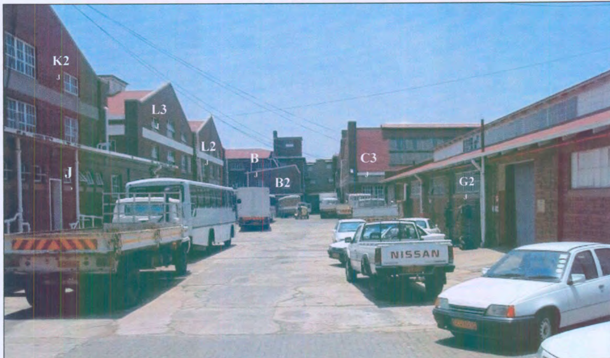
Figure 15: Pretoria State Garage central yard