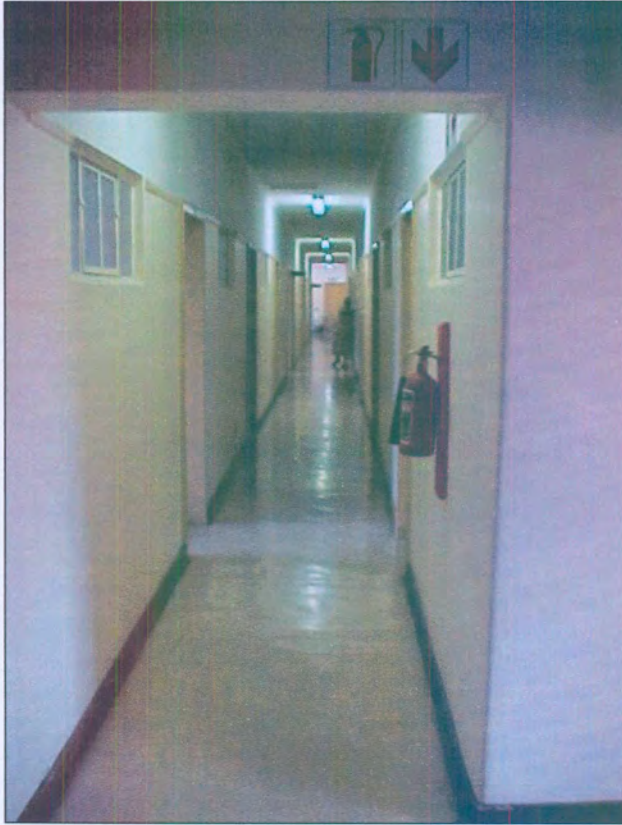
Figure 10: Interior of Administration Building

Finally, the purpose of this investigation is not to question or interrogate the architecture on site but to extend the viability and improve the spatial qualities of buildings. This will include the analysis of exterior spaces because they form an integral part of activities on site. Todd (1985:5) cautions that exterior spaces should be planned together with interior spaces and not left out to the waste of the client's money. The design of buildings should also be informed by the nature of its site as to avoid unplanned space and uncomfortable visual or physical relationship between the built and surrounding spaces, such as the uncomfortable space between blocks D3 and E (figure 11).