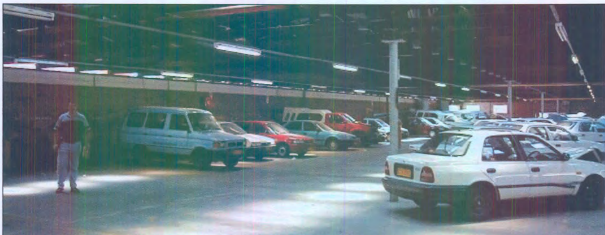
Figure 28: West elevation of block E1