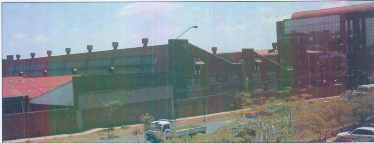
Figure 30: Southeast corner of block D

All building blocks consist of load bearing walls and internal column network. Blocks C1, D1, D2, D3, C2 and C3 consist of concrete columns, steel columns, and masonry columns respectively.