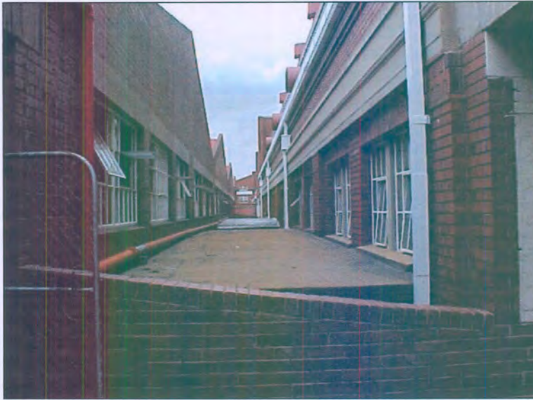
Figure 11: Space between D3 and E