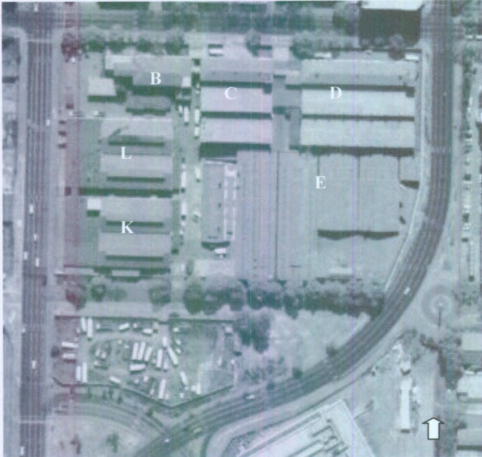
Figure 25: Building Blocks to be retained