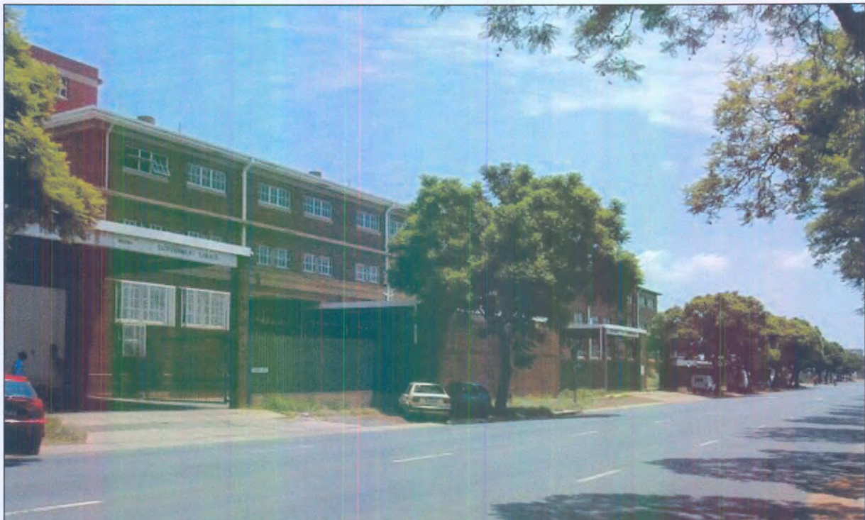
Figure 29: North elevation of blocks C and B (showing entrances on Visagie Street)

Blocks C and D comprise of buildings C1, C2, C3, D1, D2 and D3 respectively (figure 36). The 1 st and 2 nd floors of buildings C1 and D1 currently accommodate administration offices and storerooms. They are rectangular industrial administration three storey buildings. They have pitched corrugated iron roofs. Buildings C2, C3, D2 and D3 are designed as extensions of C1 and D1 respectively and form unified parking areas (figure 30). These are typical industrial rectangular, single storey buildings covered with south facing saw-tooth corrugated iron roofs containing translucent windows (figure 30 and 31).