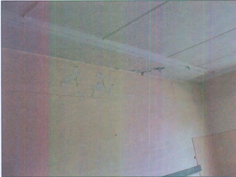
Figure 19: Evidence of roof leaking