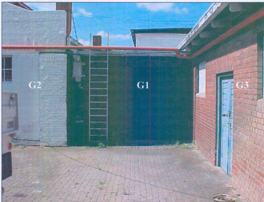
Figure 12: Typical examples of flanked buildings (G1, G2 and G3)

The current image of the site undermines the architectural potential and the viability of the site. This situation is a result of sporadic erection of relatively small structures attached to main buildings. These structures obscure the architectural qualities and cause structural defects such as cracks on main buildings and should, as a result, be demolished (figure 12 and 13). The demolition of these structures inevitably reduces the historic material fabric but is deemed to be vital for a productive future of the site. Interior and partial demolitions are dealt with separately during the descriptions of individual buildings.