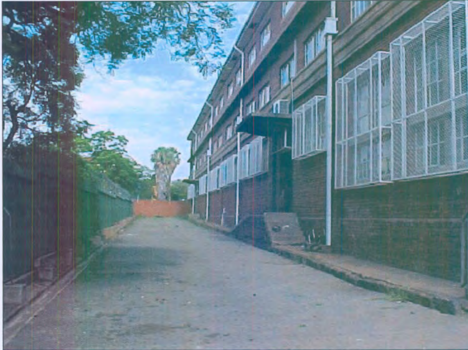
Figure 9: North elevation of Administration Building (D1)