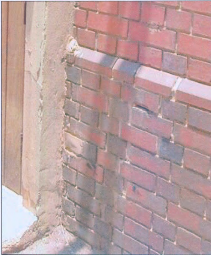
Figure 13: Structural crack caused by attached structure (J) on K2

This study proposes the demolition of buildings A, B1, B2, D4, D5, D6, D7, E, F1, F2, G1, G2, G3, H1, H2, I1, I2, J, L, M1, M2, O1 and O2 (figure 36). The demolition of these flanked structures reduces the historic material fabric but it is inevitable because they undermine the architecture and the viability of the site. The boundary wall is also due for demolition because it obscures the architecture of the site and in the past it encouraged architecturally unworthy structures such as the erection of the barbeque stand located west of L1 (figure 34).