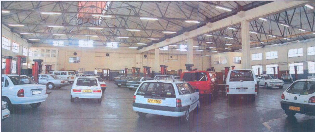
Figure 35: Interior of blocks K2 and K3