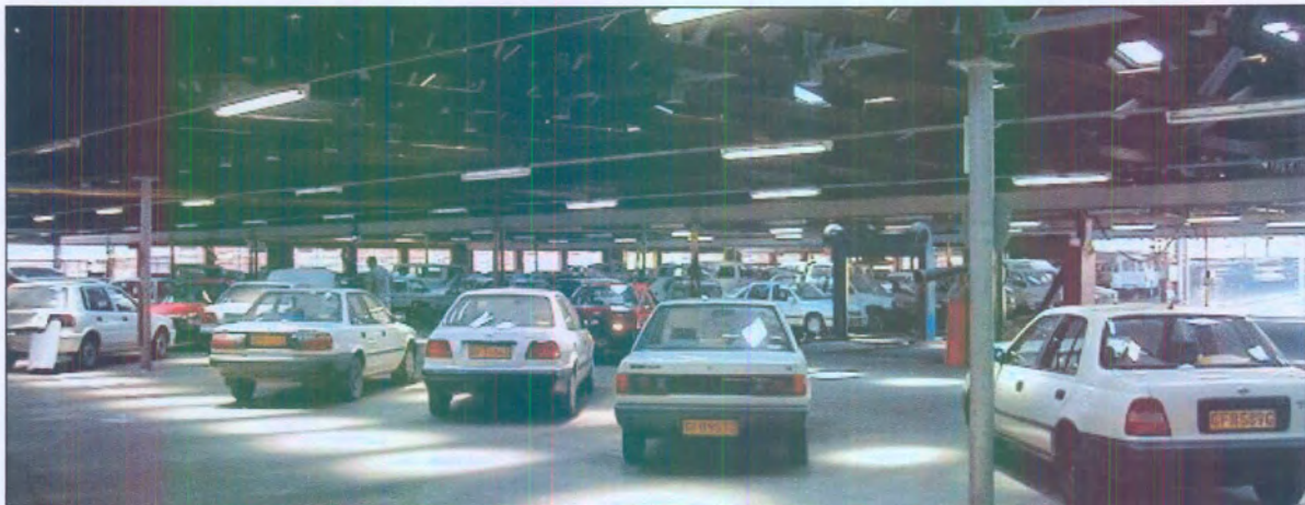
Figure 27: North and east interior elevations of block E