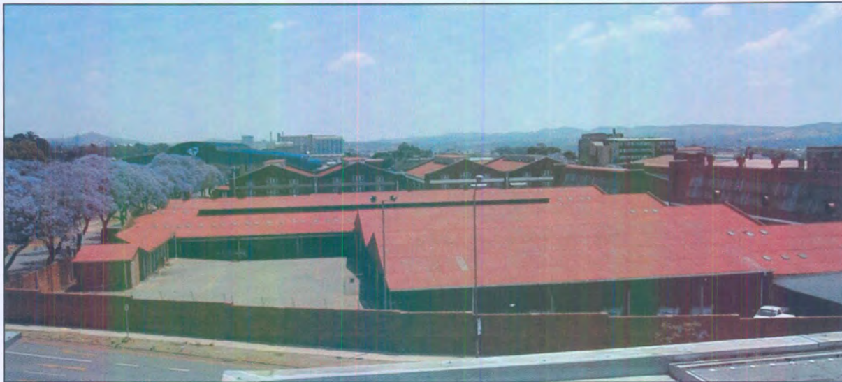
Figure 26: Block E (adjacent to the south are F and F2)

Block E is a single story structure located southeast of the site (figure 25 and 26). The structure comprises of physically sound red face-brick walls and leaking multiple corrugated iron pitched roofs. It still retains its original function as a garage, providing parking to VIP vehicles. The floor is covered with concrete interlocking blocks. The roof structure is supported on rotten wooden trusses, iron girders and concrete beams and marked by a series of roof lights and ventilators. The height of the internal volume spanned by the trusses is approximately 3m.