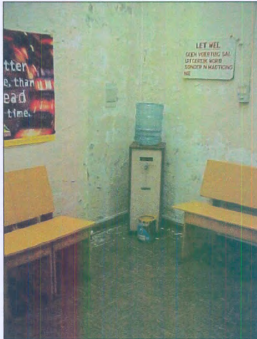
Figure 17: Capillary moisture