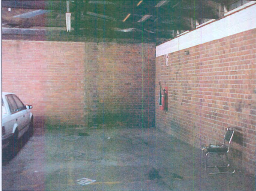
Figure 21: Breaks in masonry

and dates that are still to be thoroughly investigated to realise the long-term resilience of these buildings. It not always necessary to restore these features to their original use but could be used towards a comprehensive interpretation of the site.