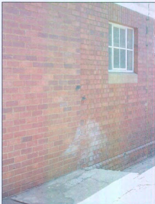
Figure 22: Blocked door opening