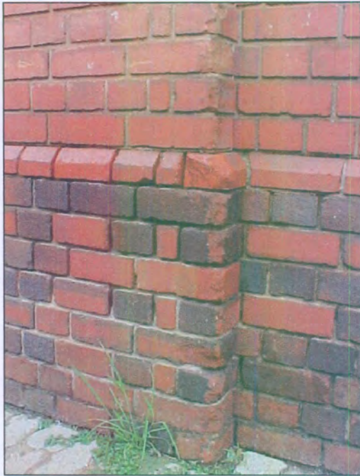
Figure 20: Raked-off mortar on English bond