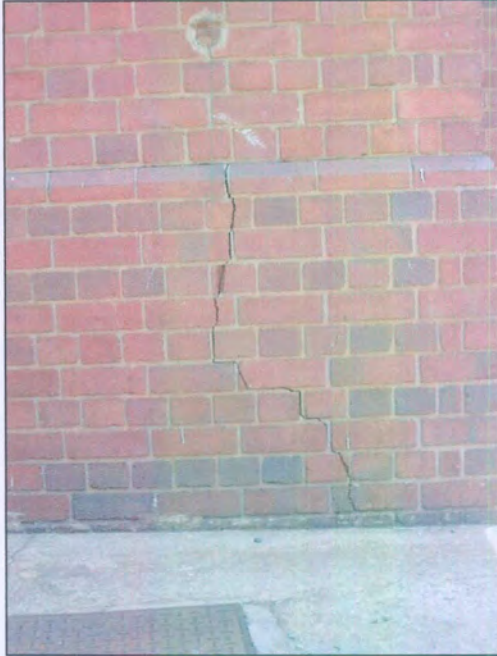
Figure 18: Structural crack on block L

Remedial measures suggest that cracks can be remedied by cutting out and rebuilding, raking out filling and repair of the material. The measures are applicable to different nature of remedies required under specific circumstances.