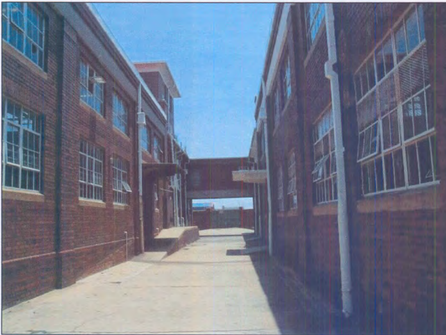
Figure 33: Blocks K and L

These structures formerly housed heavy machinery reflected by their strong structural qualities (Joubert, Owens, Van Niekerk & Partners: Architects, 1973:9). Their structure consists of load bearing perimeter walls and an internal network of concrete columns. They each contain a floor-to-ceiling height of about four meters and are covered by flat concrete slab roof. A bridge links their two top floors. These units fell into complete disuse. These blocks used to house the SABS laboratories and could be easily converted (from their current function-workshops) to accommodate similar activities.