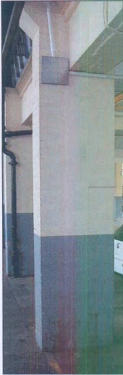
Figure 23: Brick column of D2 attached to concrete column of D1