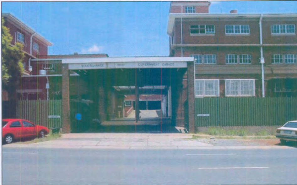
Figure 16: Main entrance

It is vital to create an entrance that will allow easy access to both pedestrians and vehicles. High traffic on Visagie Street does not allow that. The rehabilitation of Minnaar Street could be extended towards the park in order to create a suitable main entrance to both the technology park and parking to the south (figure 37). This will also emphasize the north-south axis of the park. The rest of the entrances could be maintained and enhanced for future access into the park. Blocks B, C, and D have north facing street facades, which if enhanced, could be utilised as architectural interface between the park and visitors.