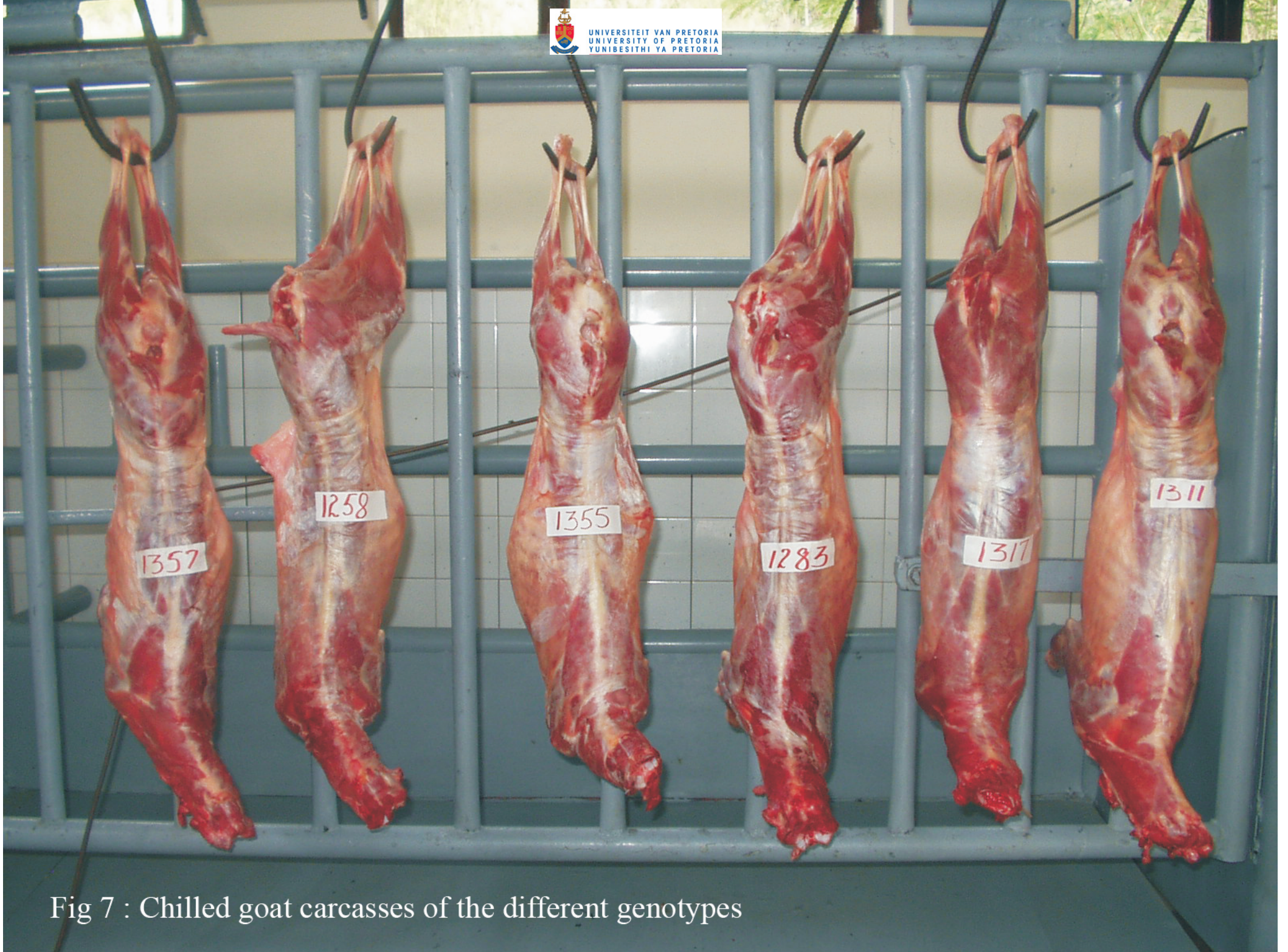
Fig 7 : Chilled goat carcasses of the different genotypes