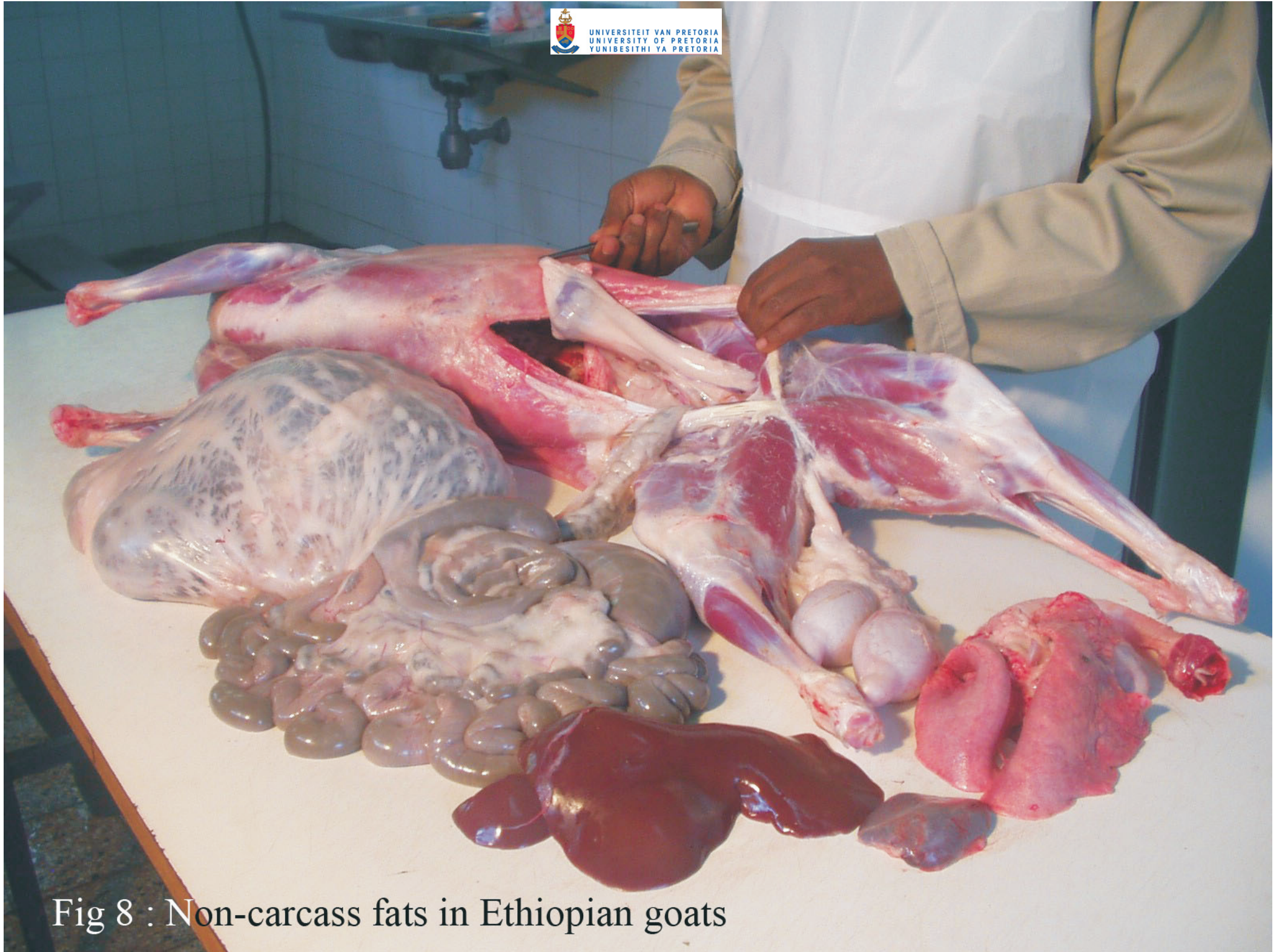
Fig 8 : Non-carcass fats in Ethiopian goats