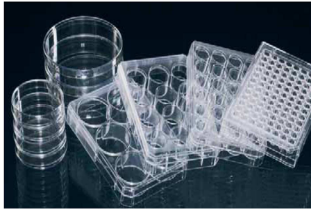
Figure 1.2: Examples of two dimensional tissue culture polystyrene trays, flasks and plates used for cell culture of adherent cells.

The conventional TCPS trays ( Figure 1.2 ) used for cell culture are flat, 2D, non-porous, and rigid, and does not represent the complex 3D cellular environment found in living tissue (Pampaloni et al., 2007).