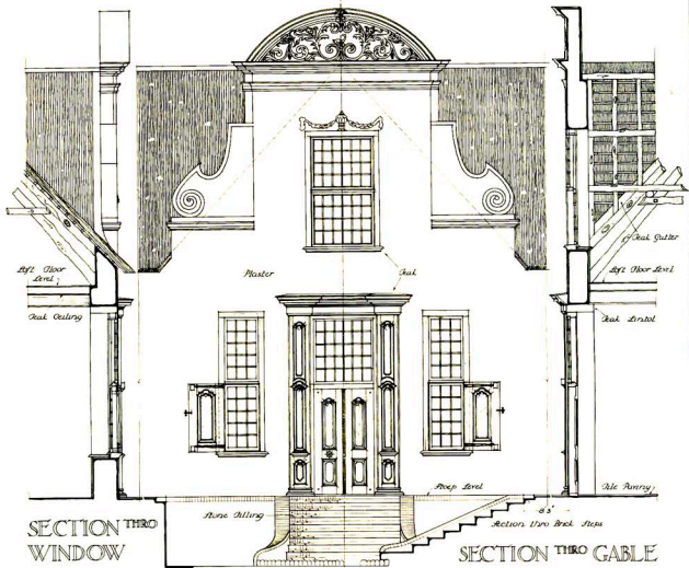
SECTION THRO WINDOW