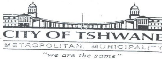
Figure ii: Newsletter distributed at Nomgqibelo's road show meetings of 14 and 15 May 2001 (a)