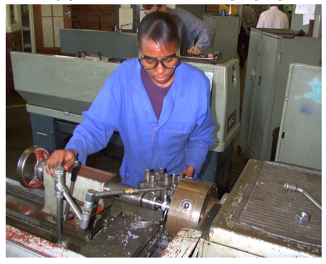
Photo 3: First lady to pass trade test as Electrician at the Pretoria West College of Engineering

One of the main challenges for the college is to be on the look-out constantly for available partnerships and learnerships from the private sector, so as to provide students with practical exposure in industry as part of the completion of the artisan-training programme. A rotation system is used so that students are provided with exposure to more than one company during their training. This helps students gain invaluable experience during their 24 weeks on-the-job-training programme. The college has established similar associations with other tertiary institutions, for example, offering practical training to students from the Technikon and the University of Pretoria.