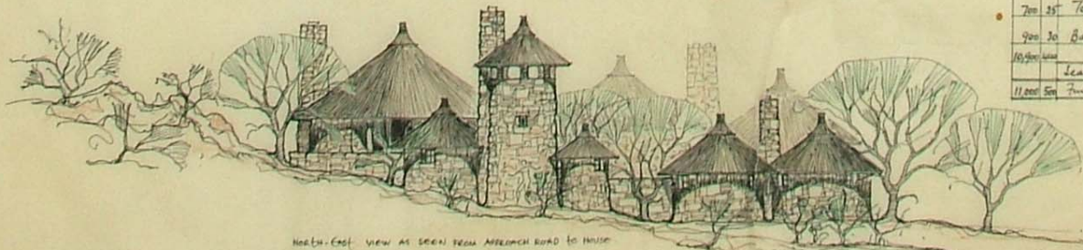
North-East view as seen from approach road to house