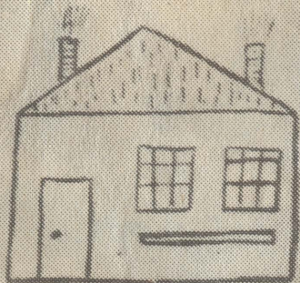
This is the House that Jack built.