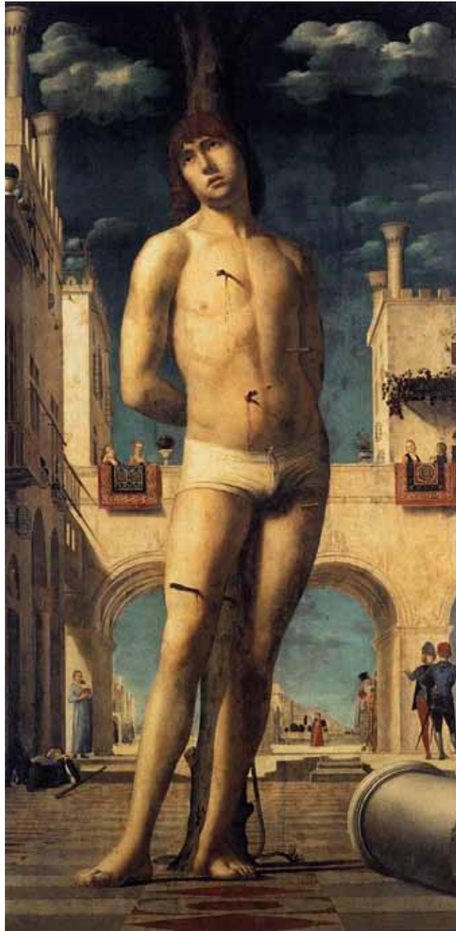
Figure 4 Antonello da Messina, Saint Sebastian , 1477-79, oil on canvas transferred on table, 171x85 cm, Gemäldegalerie Alte Meister, Dresden.

Paradoxically, the later figure of St Sebastian depicted by El Greco is bound and cannot rise to escape as the power in his muscular legs, tensed in preparation for activity, would suggest. This irony is noted by Camón Aznar (1970: 415) who describes his depiction of Saint Sebastian as follows: