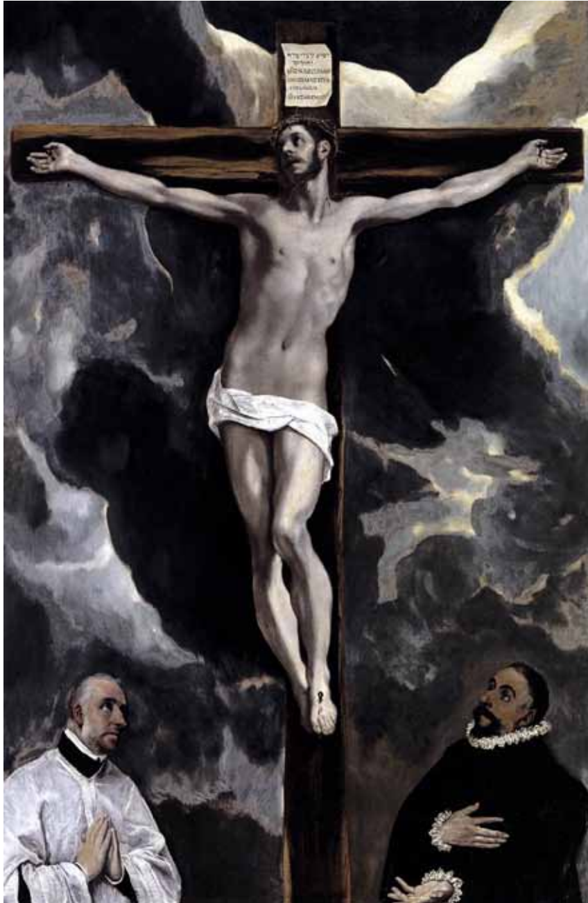
Figure 1 El Greco, Crucifixion with Donors , oil on canvas, circa 1580, 250x180 cm, originally from the Jesuit Church or San Juan Bautista Toledo, Musée du Louvre, Paris.

The question put forth in this research is how El Greco's representation of Christ on the cross in the Crucifixion with Donors , dating from circa 1580 (figure 1) conforms to the required decorum in a post-Tridentine context. The Catholic sensibility was clearly not offended by the scene in which El Greco's represents Christ's semi-nude body displayed on the cross at the moment of his encounter with death, since the picture was accepted as an altarpiece, 3 and the Roman Catholic Church in Toledo continued its patronage of the artist.