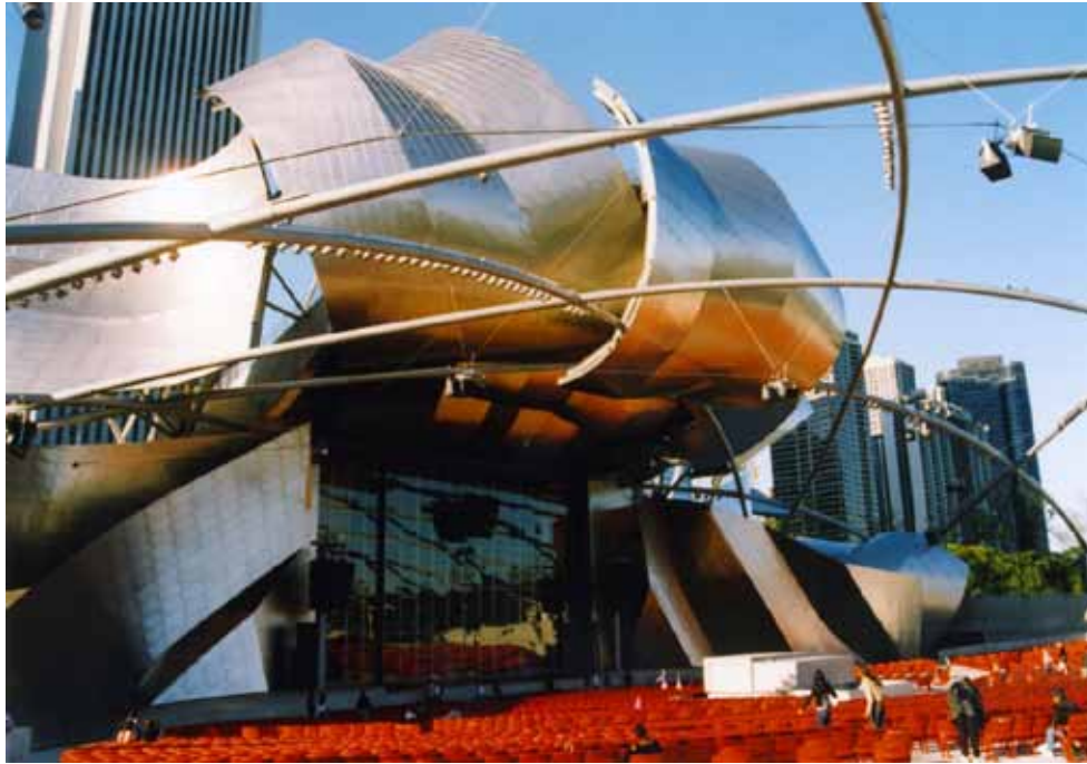
Figure 11 Frank Gehry, Pritzker Pavilion, Chicago, 1999–2004.