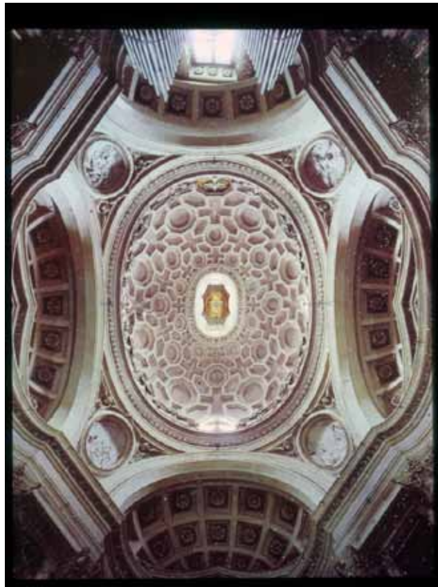
Figure 4 Francesco Borromini, San Carlo alle Quattro Fontane, Rome, c. 1638.

Renaissance Humanism, the Accademia di San Luca, and the mysticism of the Counter Reformation. At San Carlo, the trabeated elevations again conceal structural buttressing; an exhaustive structural system is presented which serves no structural purpose, as if it were shadows on the wall of the cave in the Republic of Plato. Balusters are turned upside down, volutes are inverted, and straight and concave entablature sections alternate, without apparent rational purpose. But the seemingly bizarre formal juxtapositions have underlying rational explanations. Borromini's architectural forms can be related to the contradiction between dream thoughts and dream images in Sigmund Freud's The Interpretation of Dreams (1900), and the coincidentia oppositorum , or coincidence of opposites, which is found in philosophy, language, and psychoanalysis. According to Freud, while "little attention is paid to the logical relations between the thoughts, those relations are ultimately given a disguised representation in certain formal characteristics of dreams" (544–5), 15 as rational structures are disguised by Borromini's forms. As Freud describes, "Dreams feel themselves at liberty...to represent any element by its wishful contrary..." (353), as in the forms of Borromini, which contradict their functions.