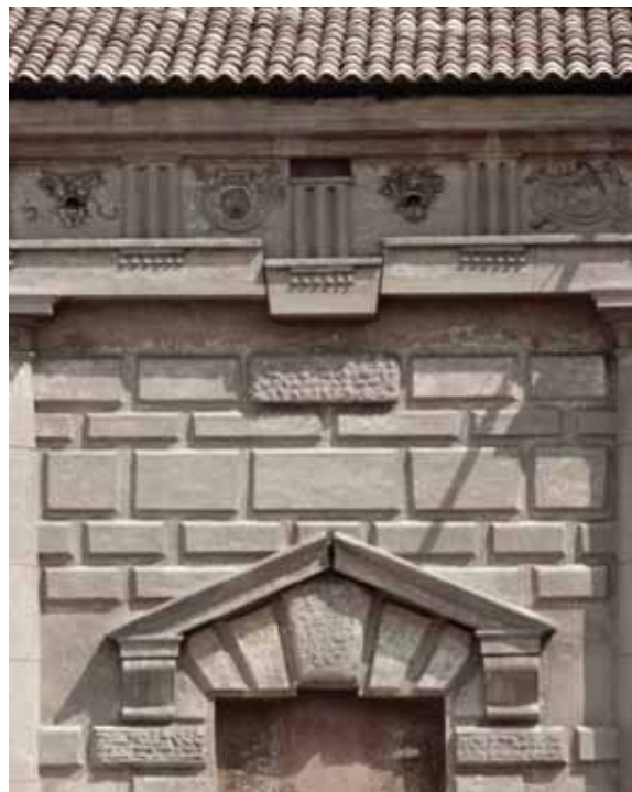
Figure 3 Giulio Romano, Palazzo del Tè, Mantua, 1526–35.

The contradiction between form and structure abounds in the architecture of Francesco Borromini (San Carlo alle Quattro Fontane, figure 4), influenced by classical philosophy,