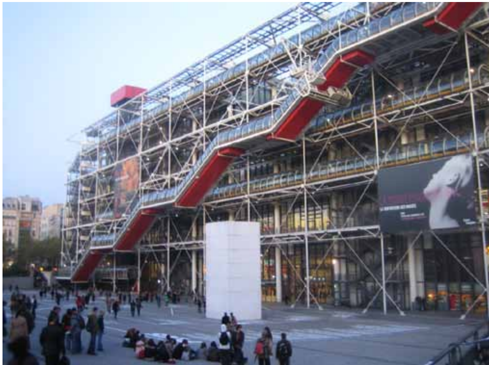
Figure 10 Renzo Piano and Richard Rogers, Pompidou Center, Paris, 1972–76.

structural systems, of columns and walls, creating a “nonfunctional redundancy” in which “each system’s function was to signify its own lack of function,” in an architecture which is an “imitation of itself as the art of need” in the words of Schelling. A hole in the floor or a false entrance contradict the program and organization of the buildings. Columns “‘intrude on’ and ‘disrupt’ the living and dining areas...” (169), according to Eisenman. The syntax of the compositions is as the syntax of language, using rhetorical devices to produce signification and to challenge the logic of signification at the same time. Eisenman borrows the syntactical structures of the architecture of Terragni, and the syntactical structures in the linguistics of Chomsky, to compose the trace or absence of presence in language, the void at the core of signification, in relation to the différance of Derrida (as described in Positions ).