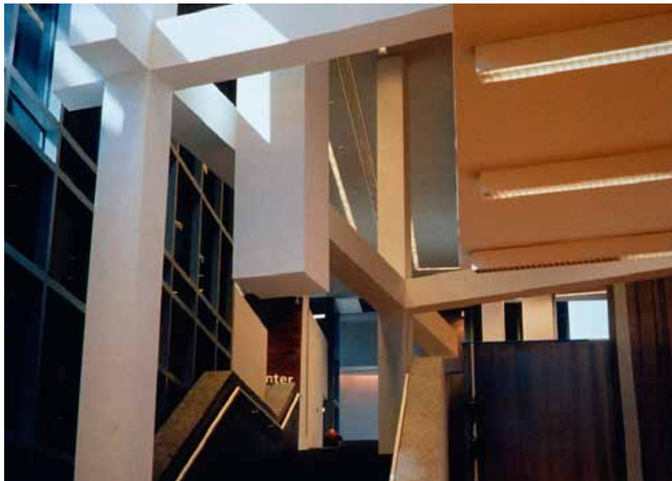
Figure 9 Peter Eisenman, Wexner Center for the Arts, Ohio State University, 1983–89.

In House I, beams clearly do not support anything; they in fact have “nothing to do with the structure of the building” (174), as Eisenman explains in House of Cards . 23 House II has two