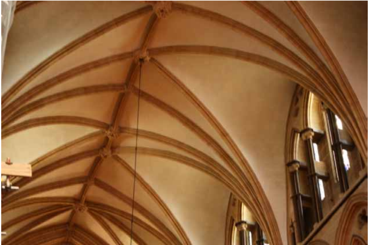
Figure 1 Saint Hugh's Choir, Lincoln Cathedral, c. 1200.

and structure. The contradiction in the architecture is related to the contradiction between reason and faith in the dialectical process of the Scholasticism of Anselm of Canterbury ( Monologion , Oratio ad sanctum Nicolaum ), the “Father of Scholasticism.” In the architecture, the sensible form, the design of the elevation, contradicts the intelligible form, the structural logic of the building. In the dialectic, the intelligible can be represented in terms of vision, “by the progress of sight from shadows” (Plato, Republic 532), 11 from the dark beyond human understanding, as described by Anselm in his Oratio ad sanctum Nicolaum . The exercise of the dialectic is ultimately carried out by reason in the realm of faith without the aid of the senses, and culminates in pure thought, noesis , the “summit of the intellectual realm.”