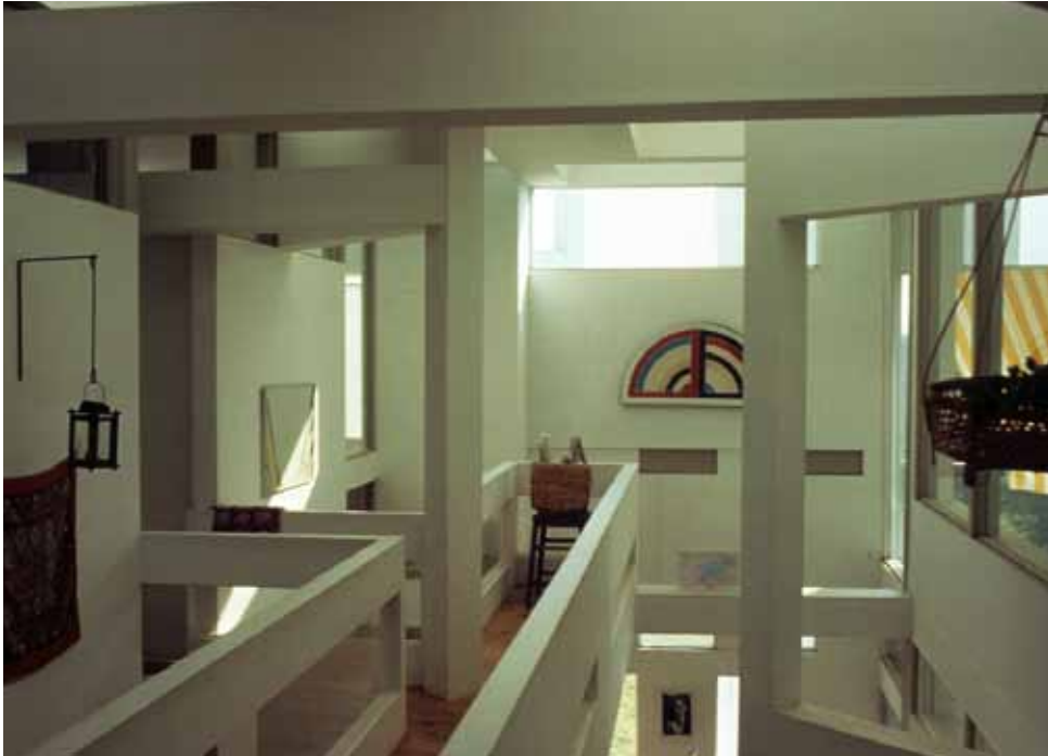
Figure 8 Peter Eisenman, Falk House (House II), Hardwick, Vermont, 1969–70.

between the material presence of the building and the conceptual organization of the building, surface structure and deep structure, matter and idea.