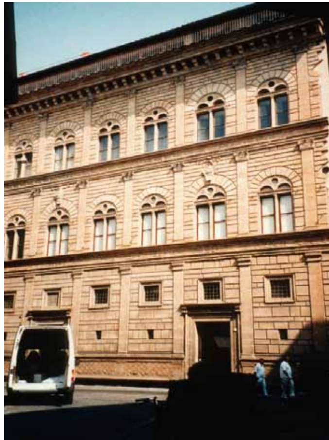
Figure 2 Leon Battista Alberti, Palazzo Rucellai, Florence, 1452–70.

On the façade of the Palazzo Rucellai (figure 2), the forms of structural classical columns perform no structural function, and the bays of the façade do not correspond to the structure of the building. On the façade of Sant’Andrea in Mantua, the forms of a Greek temple front and Roman triumphal arch are combined for a Catholic church, a contradiction in representation and purpose. The trabeated elevations on the interior of the basilica conceal Gothic-style buttressing in the bays, as at St. Peter’s in Rome. The contradiction between the lineament (as archê or archetypal principle) and matter is expressed in Renaissance painting as well, and is found in the theories of vision of Ficino ( De amore, Theologia Platonica ) and Alberti ( De pictura ). As Alberti explained, a building consists of “lineaments and matter, the one the product of thought, the other of Nature; the one requiring the mind and the power of reason, the other dependent on preparation and selection” ( De re aedificatoria , Prologue), in the realms of form and function.