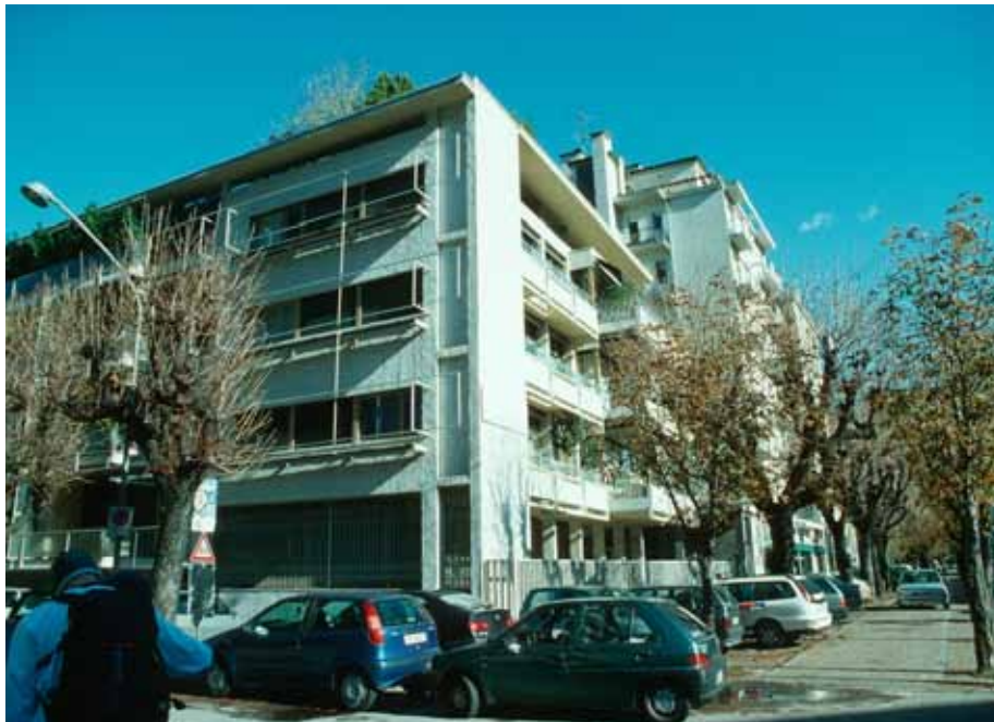
Figure 7 Giuseppe Terragni, Casa Giuliani Frigerio, Como, 1939–40.