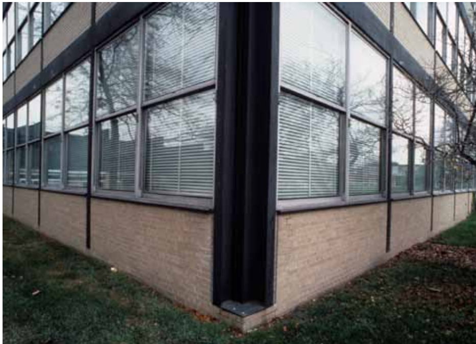
Figure 6 Ludwig Mies van der Rohe, Classroom Building, Illinois Institute of Technology, Chicago, c. 1945.

The influence of De Stijl, and the contradiction between form and function, can be seen in the Barcelona Pavilion of Ludwig Mies van der Rohe, where there are no enclosing walls to provide shelter. The architecture can be seen as an architecture of text or signification in form, in the evocation of Geist , in the tradition of Transcendental Idealism. From Schelling ( The Philosophy of Art ), architecture must be a free imitation of itself; forms which are not functional must be functional in appearance, as in the I-columns on the facades of Mies' buildings in America. In the evocation of Geist , an absence is contained within the presence of the architecture, as in