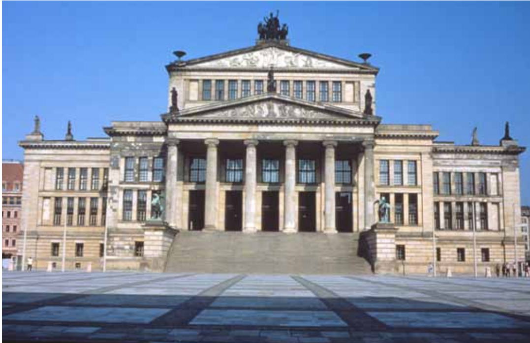
Figure 5 Karl Friedrich Schinkel, Schauspielhaus (Konzerthaus Berlin), 1818–21.

express directly the pure idea.” The trabeated façade of the Schauspielhaus in Berlin contradicts the structure and program of the building; according to Schelling, architecture must contradict itself in its form in order to express an idea and in order to be art. The Transcendental Idealism of Schinkel’s architecture would influence the architecture of Ludwig Mies van der Rohe in the twentieth century, in the contradiction between mind and perception, form and function.