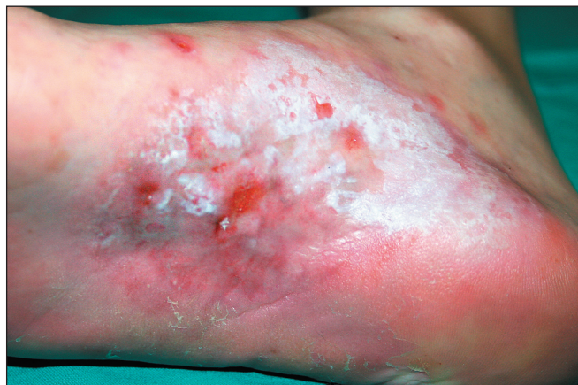
Fig. 2. Plantar ulceration Ryc. 2. Owrzodzenie na podeszwie