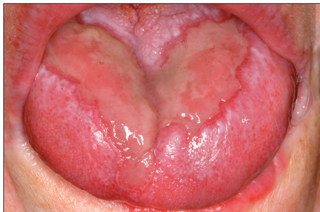
Fig. 1. Ulceration of tongue Ryc. 1. Owrzodzenie na języku