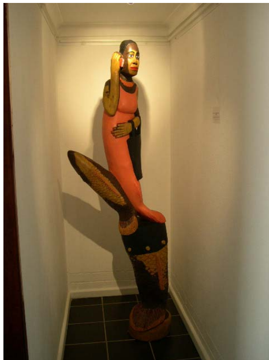
Figure 5: Collen Maswanganyi, Technology at its best (2005).