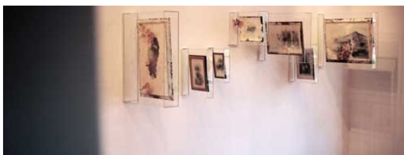
Figure 10: Frikkie Eksteen, Detail from Hanging Garden (2004).

From Reconciliations exhibition, University of Pretoria, 2005.