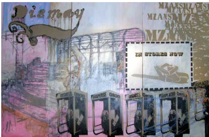
Figure 7: Kudzanai Chiurai, Mzansi (2005). Mixed media on canvas. From Reconciliations exhibition, University of Pretoria, 2005.