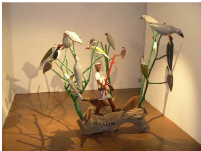
Figure 3: Johannes Maswanganyi, Paradise (2005).

Whilst Johannes's work is entrenched in the socio-political histories of Southern Africa, Collen corroborates global impulses and the impact of new technologies on disenfranchised communities. Sculptures of Collen such as The Modern Mind (2005) (Figure 4) and Technology at its Best (2005) (Figure 5) reveal the artist's awareness of the postmodern African as a global citizen and the transforming influence of technology on people's lives. In the latter work a black mermaid is engaged in conversation on a cell phone, very subtly suggesting that patterns of thinking in many South African cultural communities display leftovers of African hegemonies of belief and superstition intermingling with postindustrial strategies of systems thinking and media