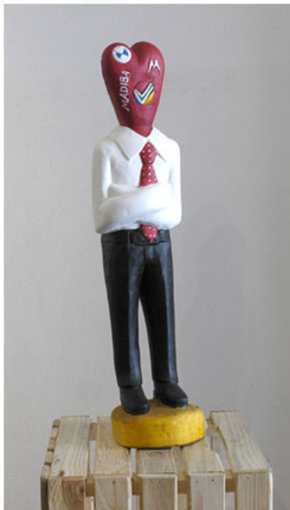
Figure 4: Collen Maswanganyi, The Modern Mind (2005).

communication. In a work such as Board of directors (2007) (Figure 6), Collen humorously deals with social aspiration and notorious climbing of the corporate ladder, and relentlessly interprets technology as empowering and as having a positive impact on rural communities.