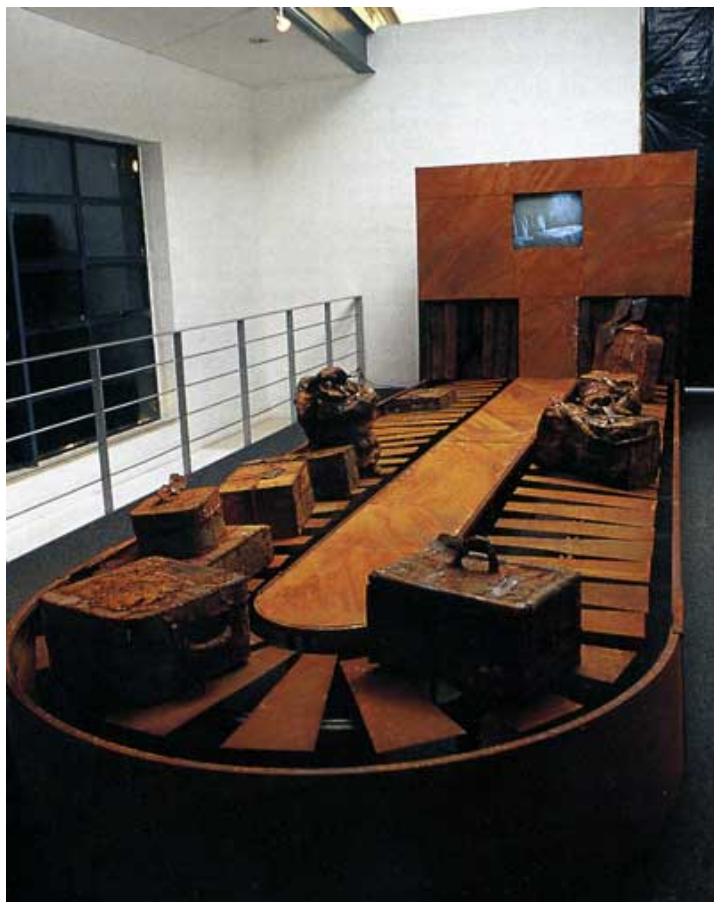
Figure 9: Jan van der Merwe, Baggage Arrival (2001). Found objects, rusted metal, TV monitor, security camera and electric motor.

From Reconciliations exhibition, University of Pretoria, 2005.