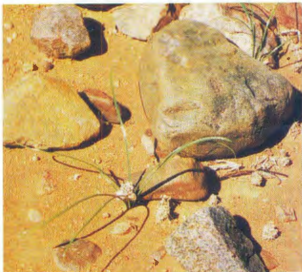
FIG. 1 Ornithogalum nanodes growing in its typical surroundings. Note the sparsity of other vegetation

The above-ground part of the inflorescence is short (c. 3 cm but sometimes longer) and the stalk starts at ground level. Flower buds are at first arranged close together but separate out as they mature. The flower has six petals, which are cream (dark white) with a brown line. It matures to give a green three-chambered fruit which develops black, flat, winged seeds with a white kernel.