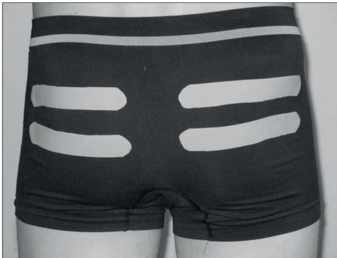
Fig. 4. Posterior view of the placebo I-strip placebo KT application method (group B).