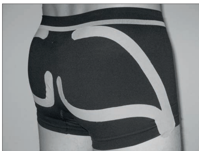
Fig. 3. Postero-lateral view of the Y-strip KT application method (group A).

wide were used. The tails of the Y were 30 cm long and 2.5 cm wide, leaving a base of 5 cm (the estimated distance between the subject's greater trochanter and fifth lumbar (L5) spinous process). Subjects were asked to lie on their sides with the hip in neutral alignment. The base of the kinesio tape was stabilised and the anterior tail nearest to the clinician was taped to the iliac crest with tape tension of between 50% and 75%. Subjects were then asked to flex, adduct and internally rotate the hip and flex the knee. The kinesio tape was stabilised and the posterior tail was attached to the sacral base, enclosing the gluteus maximus muscle, with the tape tension again between 75% and 100%.