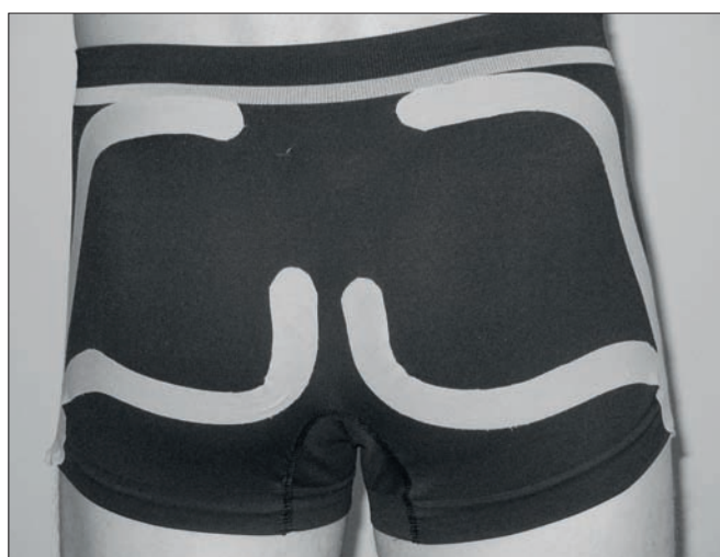
Fig. 2. Posterior view of the Y-strip KT application method (group A).

Kinesio tape was pre-cut and then individually tailored to each subject just before application. Group A's taping was applied bilaterally over the gluteus maximus muscle, as illustrated in Figs 2 and 3. The two Y-shaped pieces of taping of approximately 35 cm long and 5 cm