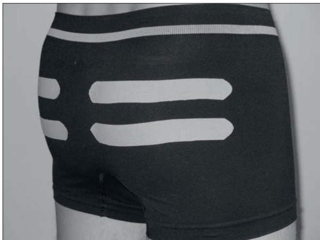
Fig. 5. Postero-lateral view of the neutral placebo KT application method (group B).

Subjects completed a standardised dynamic warm-up of 10 body-weight squats, lunge walks for 10 metres and buttock kicks for 10 metres. Thereafter each subject performed 5 CMJs at the Vertec at sub-maximal effort as training to decrease bias because of the learning effect. 27 Five practice jumps have been shown to adequately reduce the effect of learning on improvement of the outcome measure. 29