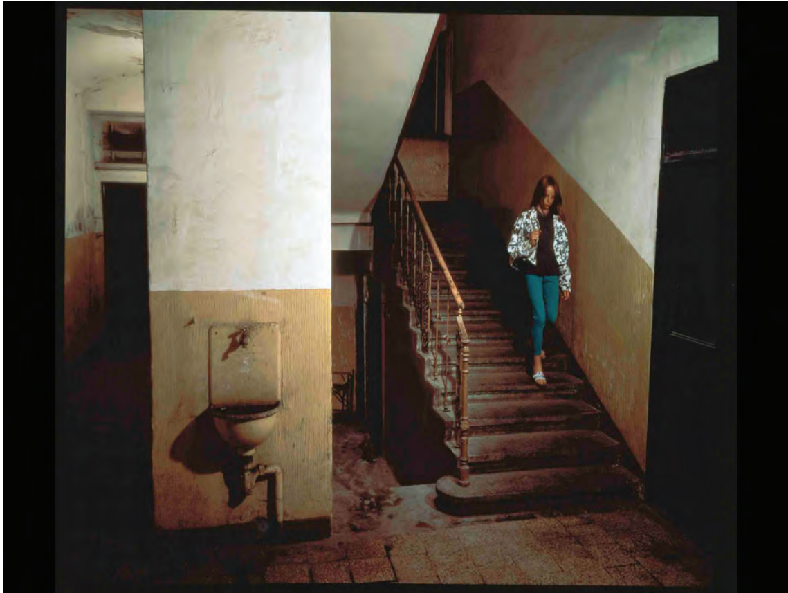
Figure 1 Jeff Wall, Odradek, Táboritská 8, Prague, 18 July 1994 (1994, transparency in lightbox, 229 x 289 cm, Frankfurt aM, Museum für Moderne Kunst).