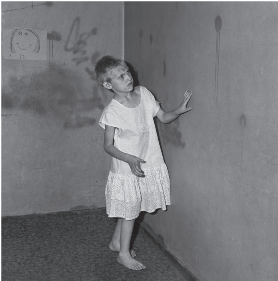
Figure 3 Roger Ballen, Girl in white dress , from Boarding house (2002, silver gelatine print, 50 x 50cm).

Let me begin by describing a picture (Figure 3). It is grey toned. A girl in a white dress is looking anxiously at a runny, spray-painted spot on a bare wall; her left hand is lightly touching the wall; her right hand appears on the brink of grasping something in the air. There are several such spots and other spray-painted marks and drips on the wall she is facing. Except for its greyness, the wall could be part of one of Cy Twombly's paintings. Traces of damp mark the wall's bottom periphery, suggestions of distant mountain ranges in Chinese landscape paintings. The edge of the girl's shadow falls across the division of carpeted floor and wall, crossing the vertiginous boundary separating the horizontal and vertical; the real and illusory; the solid and ghostly; body and no-body. The carpet is old; its mottled pattern brings to mind the worn-out carpets of decaying hotels. On the wall to the left and behind her, there are more spots and marks, as well as a smiling face drawn on a piece of paper, perhaps by a child or the photographer himself. Below the smile the artist has scribbled "Me" in a child's hand.