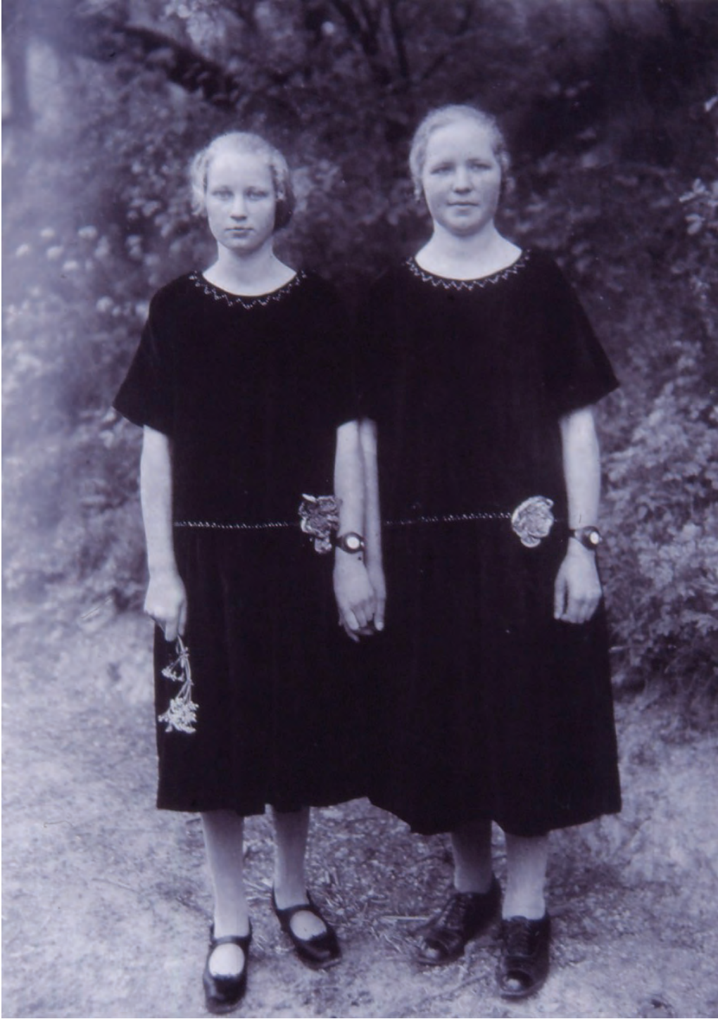
Figure 8 August Sander, Sisters (1927, gelatin silver print, 33 x 24.5 cm, New York, MoMA).