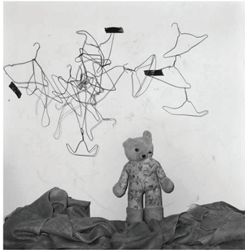
Figure 12 Roger Ballen, Configuration , 2003, gelatin silver print, 40 x 40 cm.