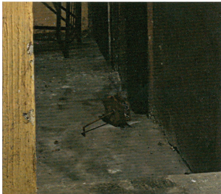
Figure 2 Jeff Wall, Odradek, Táboritská 8, Prague, 18 July 1994 (detail).

Odradek, as the Thing that outlives us and illuminates obscurely, is an allegory of ruin. 2 Incomplete, ambiguous, and mortifying like a photograph; it is also intricately related to the