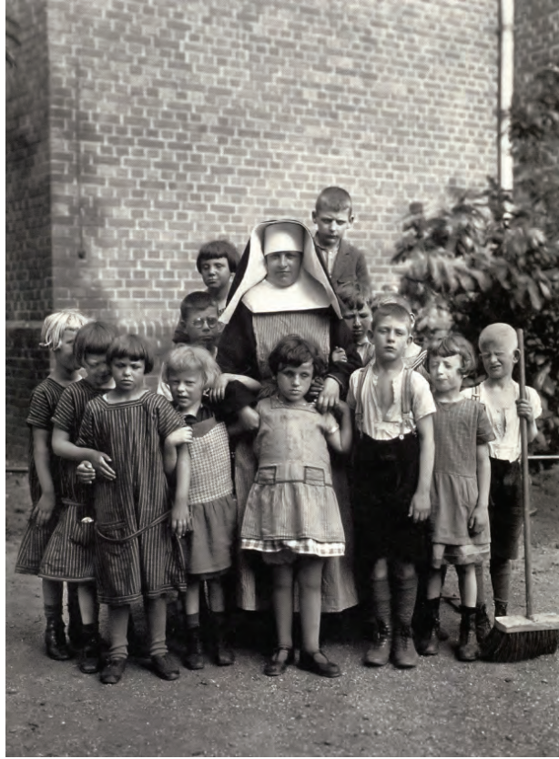
Figure 4 August Sander, The foster mother (c. 1930, gelatin silver print, 26 x 19.6 cm , London, Anthony d'Offay).