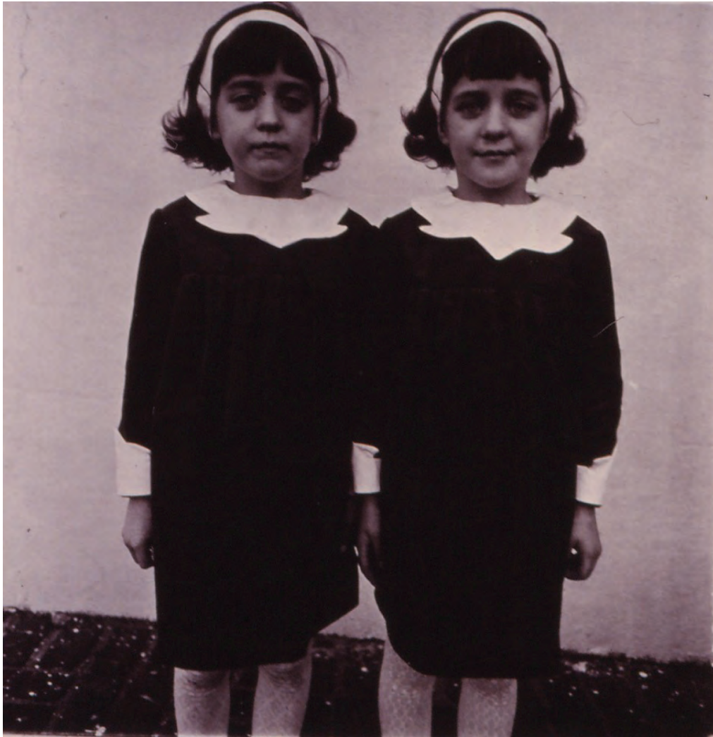
Figure 9 Diane Arbus, Identical twins , Roselle, New Jersey (1967, gelatin silver print, The Estate of Diane Arbus).

At first glance, this translates as the elimination of the stifling atmosphere of aestheticised aura and artificial distance that Benjamin deplors as the mark of bourgeois studio photography from the late nineteenth century (Figures 10 & 11). In the absence of authentic experience predicated on absorptive distance and the return look (cf Benjamin 2003d: 338), bourgeois portrait photography simulates authenticity by way of the pose, the exotic, and the blank stare (cf Benjamin 1999b: 518, 526 & 2003d: 340, Costello 2006 & Schoeman 2011).