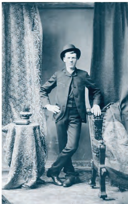
Figure 11 Anon, Portrait, late 19 th century, hand-coloured American tintype (Photo: < http://arts.jrank.org/pages/11555/tintype.html > “Tintype – carte de visite, in situ, The Cyclopedia of Photography”, accessed 20 February 2011).