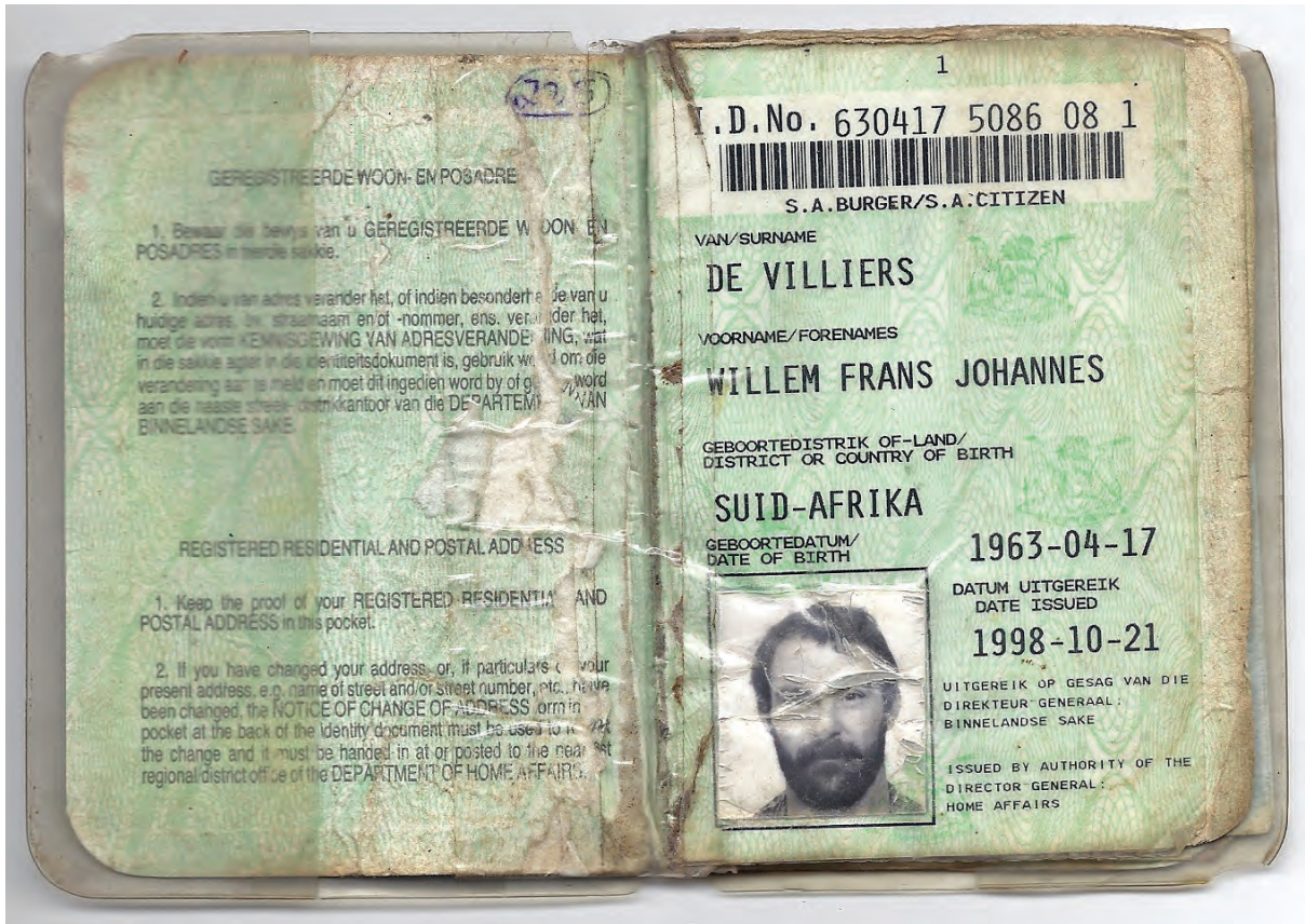
Figure 20 Found identity book.