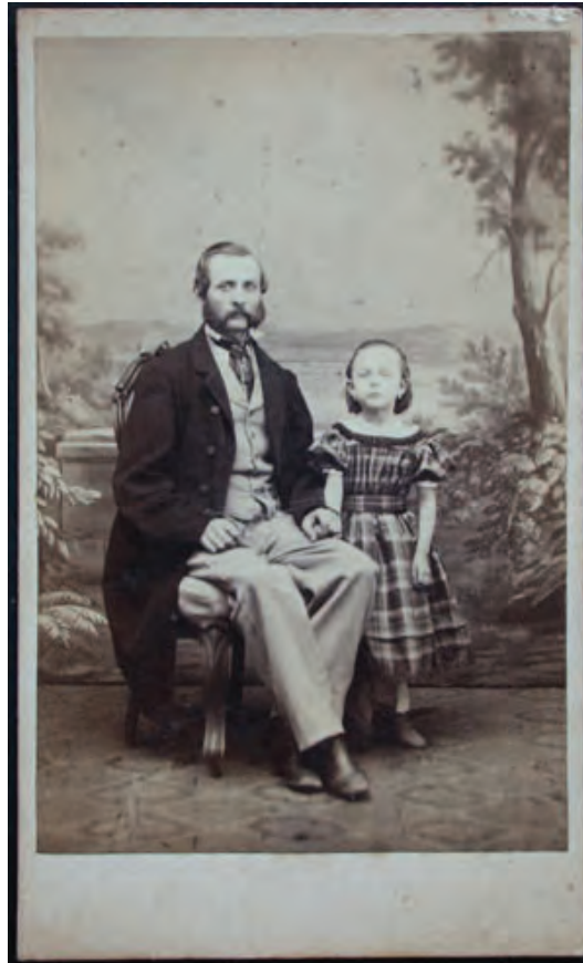
Figure 10 Portrait of man and child, Atelier of Robert Wallich (c. 1895, Berlin, Einholz Collection).