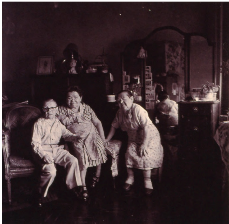
Figure 5 Diane Arbus, Russian midget friends in a living room on 100 th street, NY (1963, gelatin silver print, 39 x 37.5 cm, New York, The Metropolitan Museum of Art).