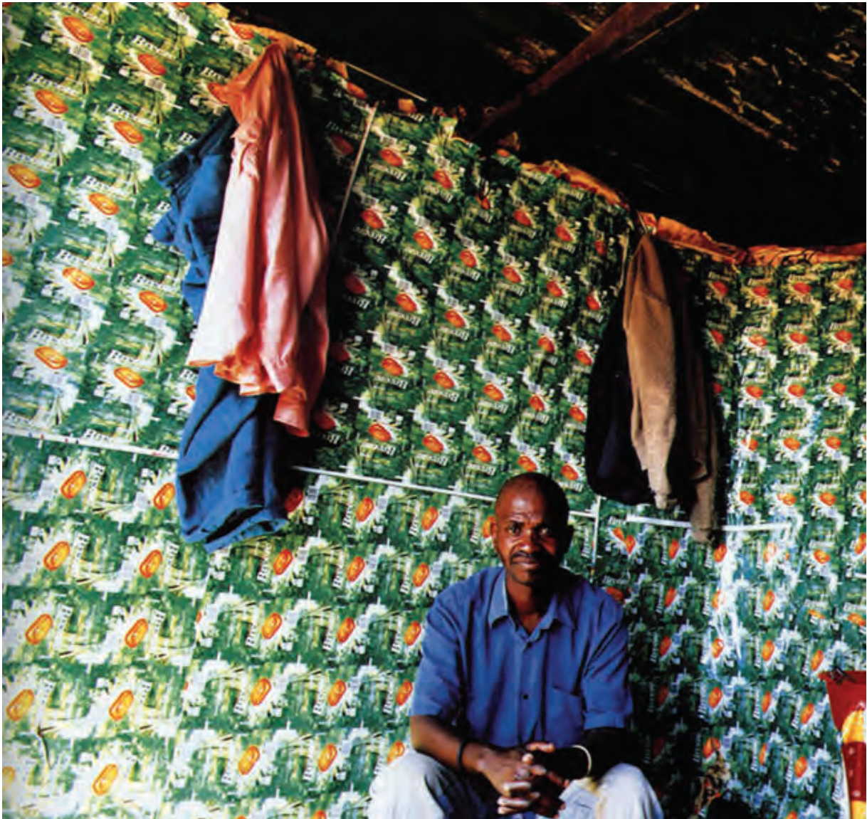
Figure 14 Zwelethu Mthethwa, Untitled (1991, c-print, 92.5 x 129.5 cm, New York, Jack Shainman Gallery).

While Mthethwa's ornamentalism (Figures 14 & 15) disguises the flattening and obliteration of the figure, which arguably further alienates and disenfranchises the sitters from the potential of their "unique interior lives"; 12 the works of the Benin photographers un hinge the hardened stereotype through negation.