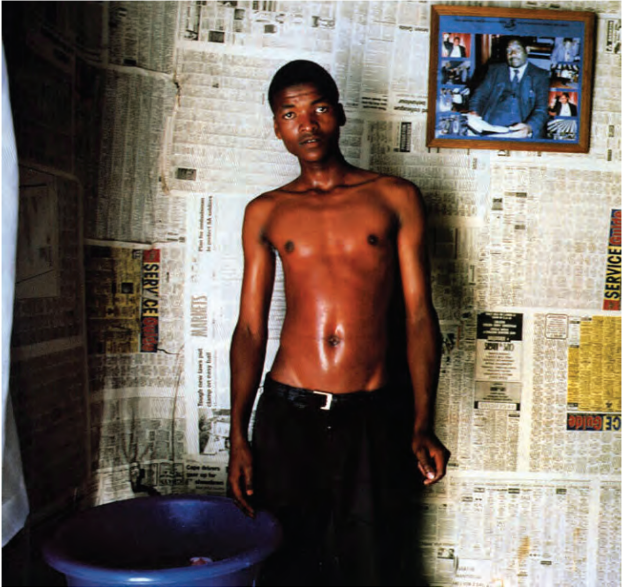
Figure 15 Zwelethu Mthethwa, Untitled (1999, c-print, 92.5 x 129.5 cm, New York, Jack Shainman Gallery).

In Pigeon's police photograph (Figure 16), which resembles Richard Avidon's portraits in its clarity and directness, if not chic, the handcuffs dialectically reverse the stable category of colonial, racial, and gender bondage, guilt, and fate. Méhomé's half-portrait of a young man (Figure 17) "staring at and beyond us with misaligned pupils" (Enwezor 2005: 10) in a mask-like face, surrealises the mythic reification of the real, unsettling the colonial gaze. Unlike Mthethwa's work, it "forces open the relationship between photography and traditional modes of representing the real in African art", to cite Okwui Enwezor (2005: 10), 13 opening up the liberating or reifying oscillation of "myth-work" (cf Damisch 1996: 119 & Ricoeur 1991: 486, 487).