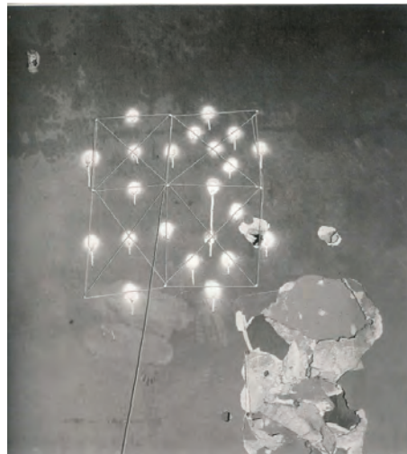
Figure 13 John Divola, Untitled , 1974, gelatine silver print, 35.5 x 35.5 cm.

Ballen's ready admission that his photographs represent his own constructed, fantasy world, suggests that they partake of Divola's deconstruction or vandalising of meaning, stability, and transparency. In thematising inevitable decay and entropy, they act even against themselves, undoing their sense of art and semblance, authorial power, will, control, and reification. As with Divola's work, their ambiguous performativity undoes both objectivity and subjectivity, revealing the unconscious as a fictional writing pad, one we continually unmake and remake.