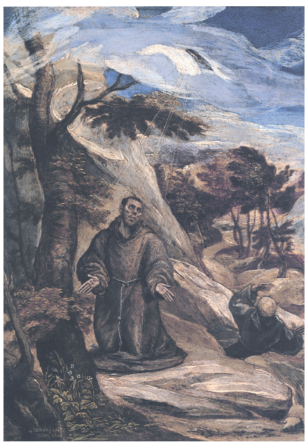
Figure 2 El Greco, Saint Francis Receiving the Stigmata, early 1570s, tempera on panel, 28,8x20,6 cm, private collection, New York (source: Wethey 1962).

It is not the saint himself who sees the heavenly apparition because he is looking in front of him while undergoing the agony of the stigmata; it is his companion, the reclining figure with his back turned to the viewer.