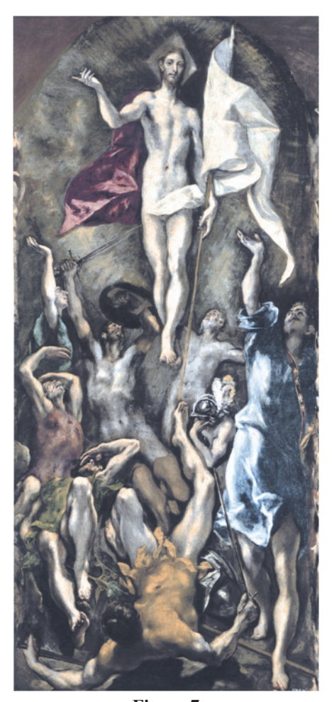
Figure 7 El Greco, The Resurrection , late 1590s, oil on canvas, 275x127 cm, Museo Nacional del Prado. Madrid (source: free internet).

The group of apostles and a woman surrounding the Virgin in The Pentecost (figure 8) on whom the flame of the Holy Spirit descends may be collectively described in Neoplatonic terms as those of whom "the sight is so clear that consciousness ... is no longer and self is no more" (Edman 1925: 76). They are those who are "at last united with what they have always been in origin; they are seeing and being the light which they do not even know that they see. ... It is life and thought, always in Plotinus identical, passed into rapture of attainment, existence turned into ecstasy" (Edman 1925: 76). The ecstasy of the group emanates from the Holy Spirit in the traditional symbol of a dove expanding its wings in a bust of light in the dome-shaped enclosure above the congregation being baptised in fiery flames.