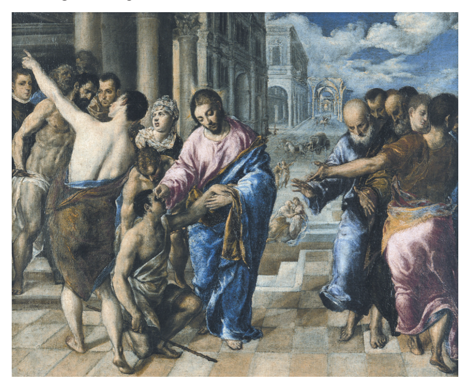
Figure 3 El Greco, Christ Healing the Blind, circa 1570-5, oil on canvas, 50x61 cm, Galleria Nazionale, Parma (source: free internet).

This composition follows Alberti's (1972: 83) guidelines for the historia <sup>16</sup> genre: "I like there to be someone in the historia who tells the spectator what is going on." The expression of this figure who looks out of the picture at the spectator, behind the healed man, is serene and detached, conveying his insight to the viewer and may thus represent the painter's self-portrait. However, pointing in the opposite direction the backturned figure's gaze is obviously away from the exterior viewer; whatever he is beholding is not visible to the viewer outside the paining. The scene from which the person who "informs" the viewer looks out also conceals the mystical scene. A dialectic is created between looking out into real space and looking into a hidden, but implied, vision, similar to that between the exalted figure and Hercules. This play of opposites enhances the meaning of the representation.