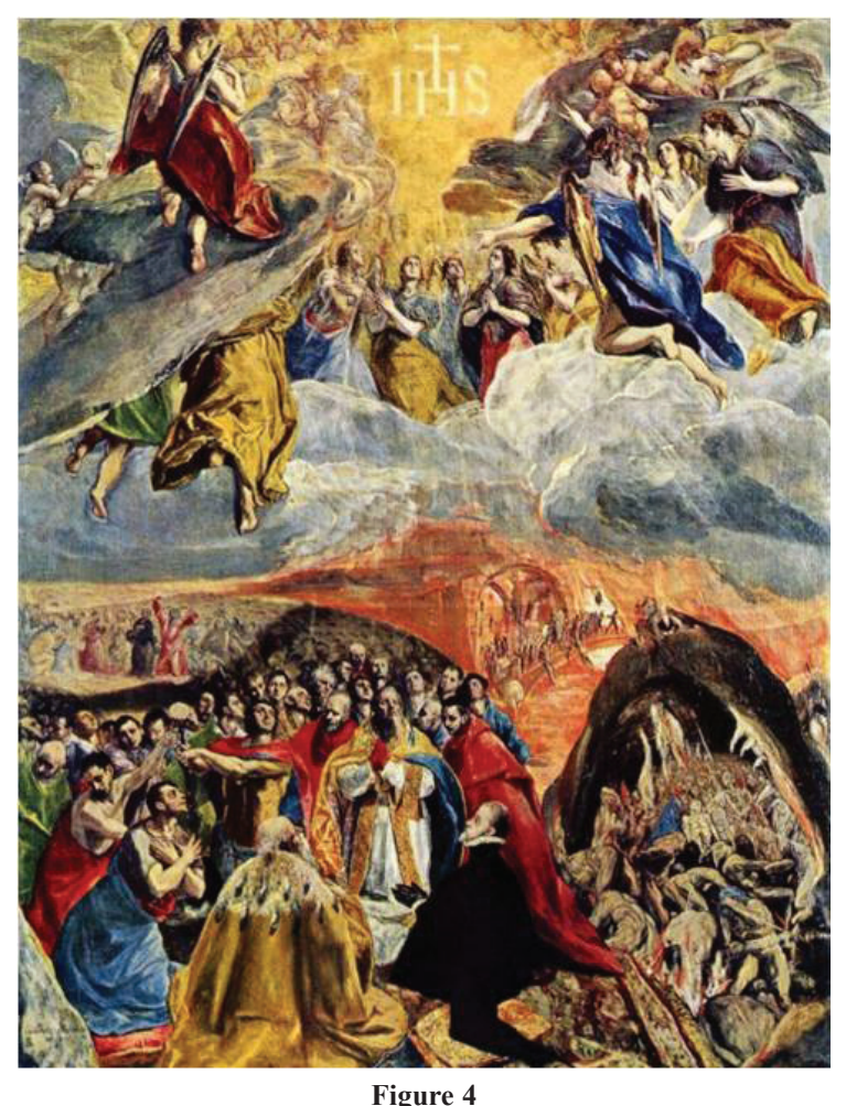
El Greco, The Adoration of the Name of Jesus (alternatively called An Allegory of the Holy League ), circa 1577-9, oil on canvas, 140x110 cm, de San Lorenzo de El Escorial.

What the backturned Doge and all the human and angelic figures looking heavenwards see is a burst of glory in which a cross and three letters – IHS – an abbreviation in Latin of the Greek name of Jesus ( IH\Sigma OY\Sigma ) appear. The Doge, placed in the centre foreground, is honoured as the backturned figure, affording him the best viewing place of the mystical apparition.