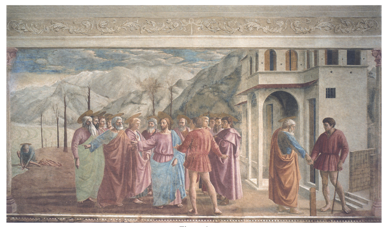
Figure 1 Masaccio, Tribute Money , 1425-27, fresco, Brancacci Chapel, Santa Maria del Carmine, Florence.

One figure, that of the tax collector, has his back turned and is in the foreground proximate to the space of the chapel. The figure is in a contrapposto stance which indicates movement, or at least the potential for movement, further into the virtual space. In its backturned aspect this figure parallels a beholder confronting the painting, while the (potential) stepping into the depth aligns with the idea of moving from the chapel into the pictorial space. In these ways beholding is thematized so as to assign the role of tax collector within the narrative scene. ... [T]here is displacement from the chapel into the image-world... .