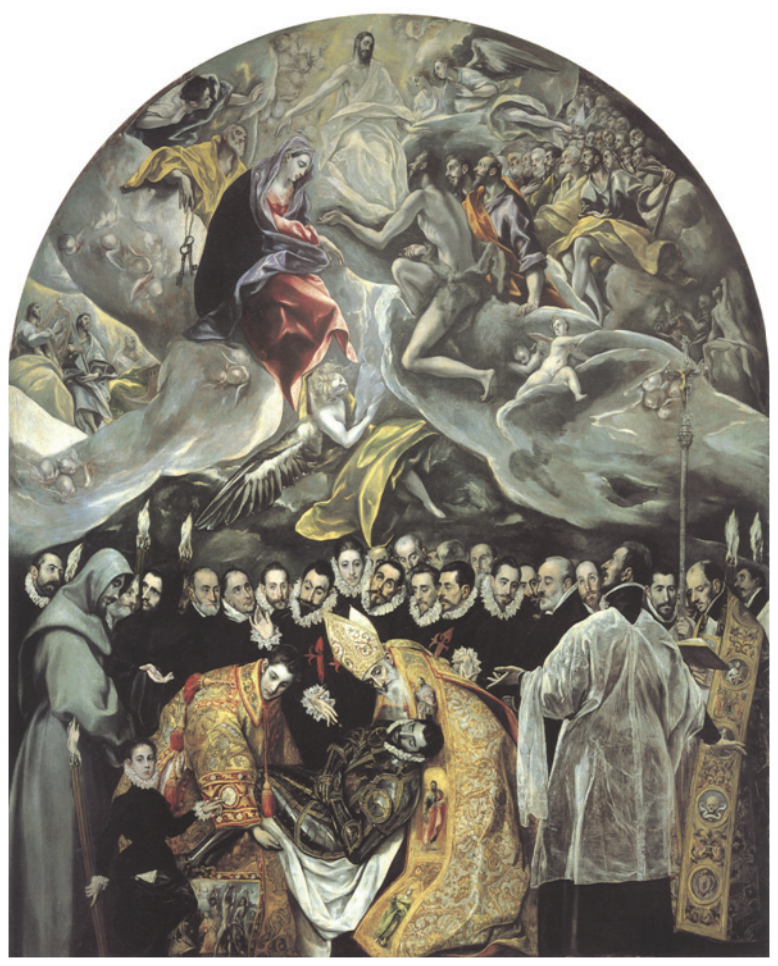
Figure 6 El Greco, The Burial of the Count of Orgaz, 1586-8, oil on canvas, 480x360 cm, Parish Church of Santo Tomé, Toledo.

In the Prado Resurrection (figure 7) El Greco envisages Christ's resurrected body in "a blaze of glory" (Finaldi 2003: 174), standing erect and holding a white banner of victory in a singularly elevated position above the earth and a diverse group of seemingly confused human figures. All these terrestrial figures (except one sleeping helmeted soldier) seem to express an epiphany, but in diverse ways, gesturing forcefully in reaction to their awareness of the unexpected cosmic event and its radiating force.