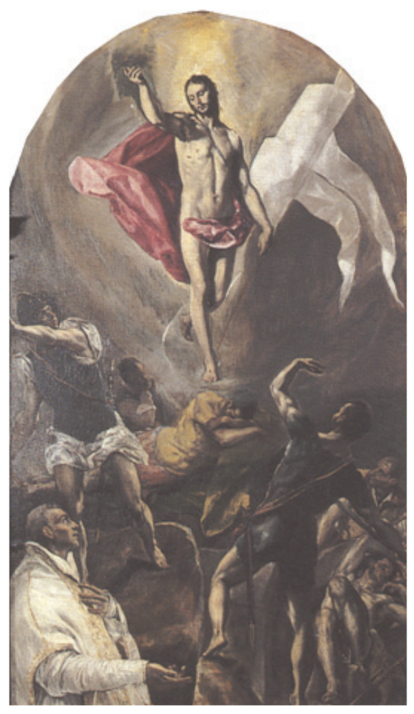
Figure 5 El Greco, The Resurrection , circa 1577-9, oil on canvas, 210x128 cm, Church of Santo Domingo el Antiguo, Toledo.

The gestures of Christ and the group below, as well as the direction of their gazes, enhance the coherence of the composition, while the figure below Christ's feet remains sleeping, ignorant of the vision.