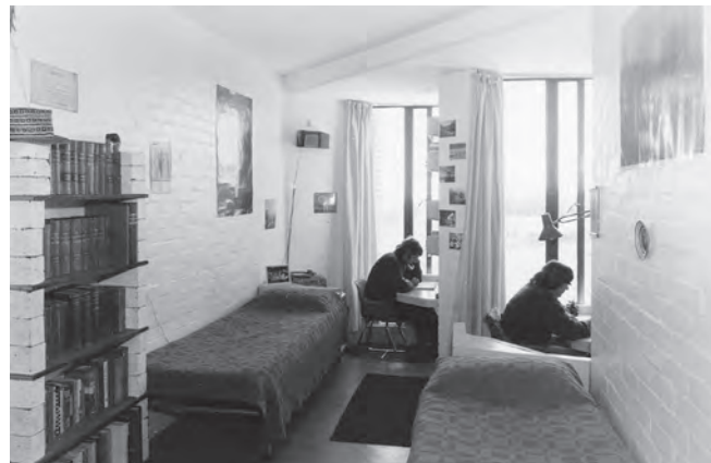
Figure 6 Interior of a male study-bedroom, Phase 1. Note the step into the study carrels.

On enquiry De la Bat conceded that while the estimates were reasonably accurate, an unforeseen demand for student residential accommodation had arisen due to the effectiveness of the RAU publicity office and the branding of the modern university (2011: e-mail of 20 April). There was thus a need for additional residential accommodation soon after moving onto the permanent campus, and any serious client would first take stock of the existing before commissioning any extension. A post-occupancy evaluation of sorts had been conducted by RAU for we read of research which revealed that students “responded negatively to the uniform and inflexible room layout of the existing hostels” ( Architect & Builder , May 1979: 16).