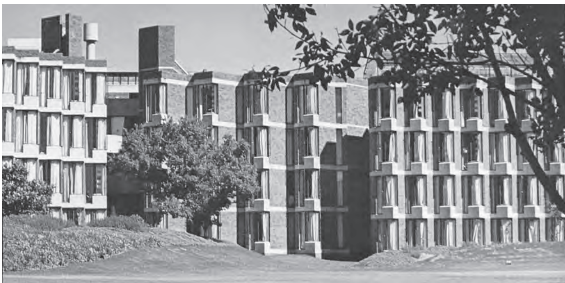
Figure 2 RAU male residences with study carrels facing the common outdoor space of the residence complex.

The designs for the male students’ residences for both RAU and PUCHO were being developed simultaneously during 1968-9 and in the same office space at Twickenham Ave, each with a dedicated project architect, Silvio Buffler and Maarten Coetzee respectively, yet under the design control of Meyer. Naturally synergies and similar design concepts would have surfaced as they were after all both developed for white Afrikaner male students on Afrikaans universities and were of common construction and building materials, yet each was different as conditioned by the particularities of its site. But, the decision to exclude Meyer from RAU Phase 2 could have been based on more than the similarity of the designs.