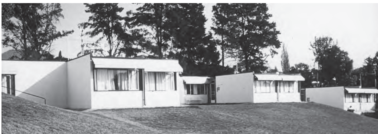
Figure 5 Afsaal, temporary RAU male residence complex, 1969. Photographer unknown (Co-Arc Architects).

The late 1960s was a period of architectural fascination with pre-fabrication and industrialised factory or system building, and a paradigm for housing by such techniques was Habitat at Expo '67, Montreal. This housing scheme of piled concrete boxes and roof terraces evoked an image of a Mediterranean village, and both the alleged expediency and the informality held wide appeal and brought fame to its Israeli architect Moshe Safdie. It was within these principles that Nel looked to the standard prefabricated concrete garage for motor vehicles to accommodate 144 male students. The prefabricated units were moved to site by truck, lifted and lowered into place by cranes, and completed in time for the new academic year beginning 1969. Afsaal proved a popular residence, informal with hardly a feeling of being an institutional building 8 .