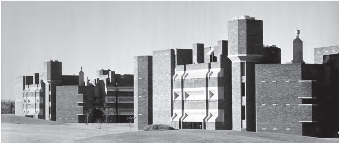
Figure 3 Rear view of male residences at Potchefstroom. Architect: WO Meyer, 1968-71.