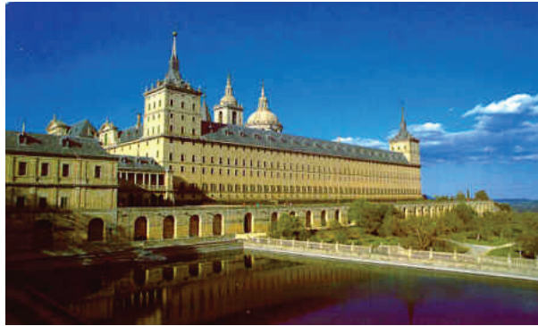
Figure 1 A view of the Monasterio San Lorenzo del Escorial, Spain.

The other king, John V of Portugal, endearingly called “The Magnanimous”, had vowed at the beginning of his reign in 1706 to fulfill his father’s wish that a basilica be built for the Franciscans, the most destitute of Portuguese friars. Furthermore, John’s desire for an heir motivated him to empty his kingdom’s coffers to build a basilica and convent at Mafra, intended to honour his superstitious vow to the Franciscans that if the seemingly barren Queen, Dona Maria Ana Josefa of Austria, bears him an heir he will reward them with a basilica and convent, as part of an edifice that would also comprise a palace and auxiliary functions. Eventually the lavish edifice, the Real Palacio e Convento de Mafra, was built at a town north of Lisbon (figure 2). The construction was only completed in 1750, the year of the death of the king, while many details had to be finished by his successors and their architects and artists.