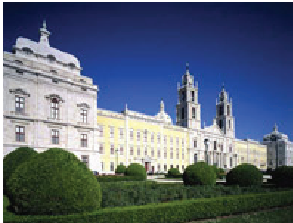
Figure 2 A view of the West facade of the Real Palacio e Convento de Mafra, showing the belltowers and turrets.

The other king, John V of Portugal, endearingly called “The Magnanimous”, had vowed at the beginning of his reign in 1706 to fulfill his father’s wish that a basilica be built for the Franciscans, the most destitute of Portuguese friars. Furthermore, John’s desire for an heir motivated him to empty his kingdom’s coffers to build a basilica and convent at Mafra, intended to honour his superstitious vow to the Franciscans that if the seemingly barren Queen, Dona Maria Ana Josefa of Austria, bears him an heir he will reward them with a basilica and convent, as part of an edifice that would also comprise a palace and auxiliary functions. Eventually the lavish edifice, the Real Palacio e Convento de Mafra, was built at a town north of Lisbon (figure 2). The construction was only completed in 1750, the year of the death of the king, while many details had to be finished by his successors and their architects and artists.