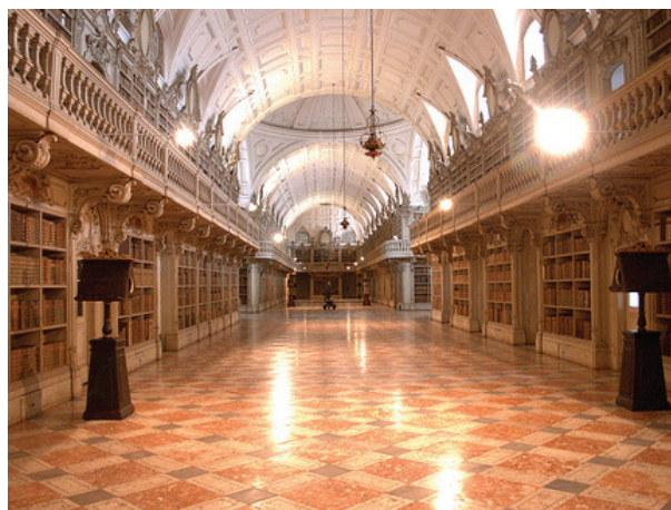
Figure 8 Library of the Real Palacio e Convento de Mafra.