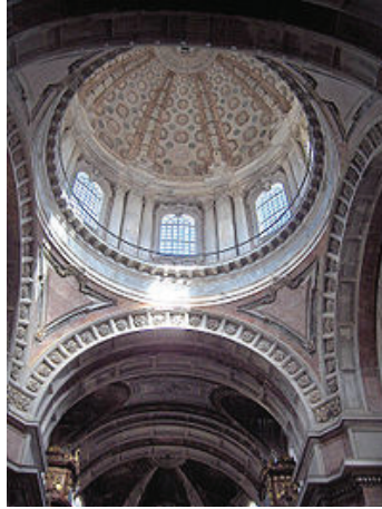
Figure 6 Dome of the basilica of the Real Palacio e Convento de Mafra (photograph: the author).