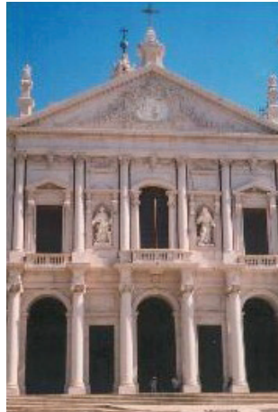
Figure 4 Facade of the basilica of the Real Palacio e Convento de Mafra.