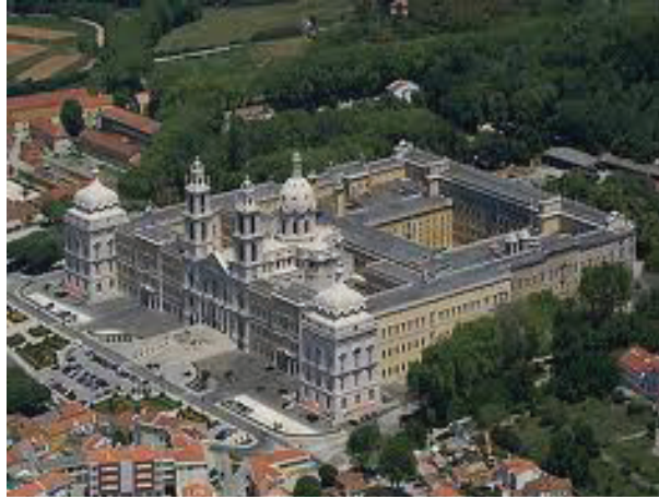
Figure 3 An aerial view of the Real Palacio e Convento de Mafra.