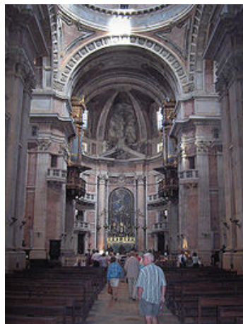
Figure 5 Interior of the basilica of the Real Palacio e Convento de Mafra.