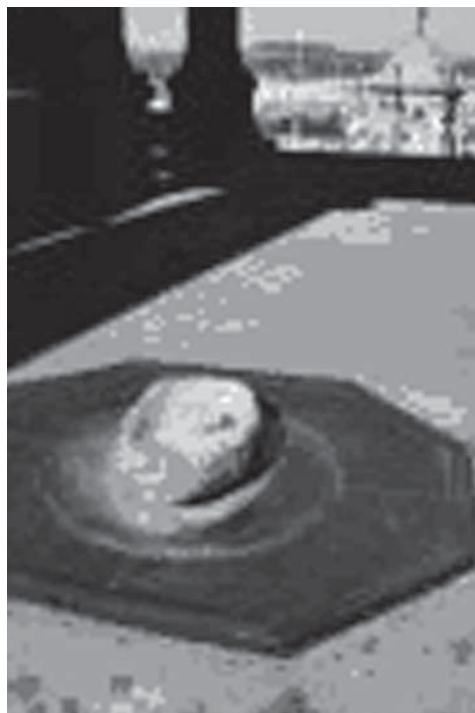
Figure 4 Wilma Cruise, Women's monument , the vestibule, 2000. Pretoria (photo Cruise).

The sweep of the stairs serves the dual function of providing a record of the actual past as well as a reminder that this history should not repeat itself. The vestibule itself is a colonnaded, vaulted opening, leading from the back of the amphitheatre through a central axis that continues up through other buildings on Meintjieskop. The original inlaid sandstone floor had an octagonal centre radiating outwards. Cruise has replaced the octagonal centre with a demarcated, textured bronze field in full registration with the original motif. In the centre of the bronze octagon, a highly polished stainless steel disc reflects the morning and afternoon sun. These two elements, bronze and steel, act as a metaphor for the archetypal African mollo , or fire in a hearth. 7