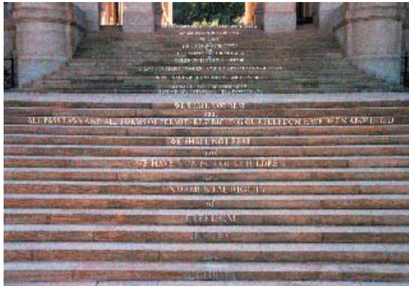
Figure 3 Wilma Cruise, Women's monument , the stairs, 2000. Pretoria.

The sweep of the stairs serves the dual function of providing a record of the actual past as well as a reminder that this history should not repeat itself. The vestibule itself is a colonnaded, vaulted opening, leading from the back of the amphitheatre through a central axis that continues up through other buildings on Meintjieskop. The original inlaid sandstone floor had an octagonal centre radiating outwards. Cruise has replaced the octagonal centre with a demarcated, textured bronze field in full registration with the original motif. In the centre of the bronze octagon, a highly polished stainless steel disc reflects the morning and afternoon sun. These two elements, bronze and steel, act as a metaphor for the archetypal African mollo , or fire in a hearth. 7