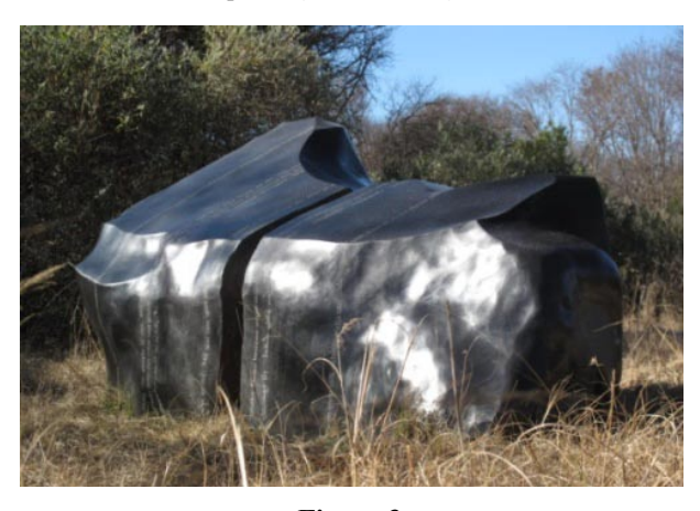
Figure 3 Split B1 and Split B2

Behold, the people is one, and they have all one language; and this they begin to do: and now nothing will be restrained from them, which they have imagined to do. Go to, let us go down, and there confound their language, that they may not understand one another's speech (Boshoff 2009).