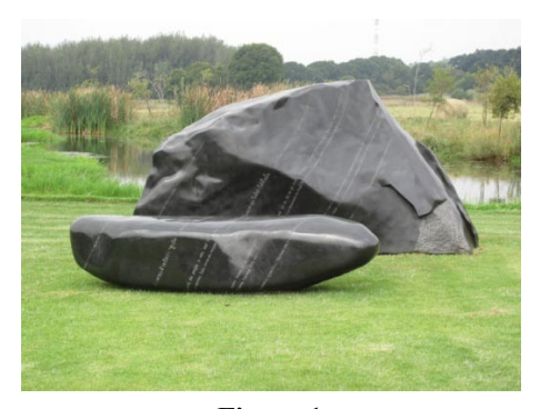
Figure 1 Willem Boshoff, Big B and Little B

Big B Dimensions: 3300mm (length) X 850mm (width) X 1680mm (height); approximate weight: 8 ton; languages (as read from top to bottom): 1. Maori, 2. Thai, 3. English, 4. Luchazi, 5. Finnish, 6. Bulgarian, 7. Sundanese; collection: Benji Liebman and Little B Dimensions: 2620mm (length) x 665mm (width) x 620mm (height); Approximate weight: 2.5 ton; Languages: as for 'Big B'; Collection: Benji Liebman (courtesy of Willem Boshoff).