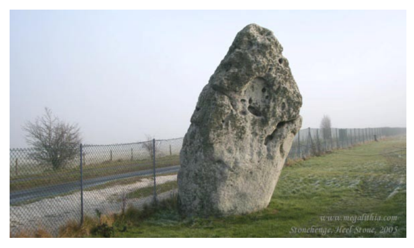
Figure 5 Heelstone, Stonehenge (www.megalithia.com%2Fstonehenge%2Fstonehenge_heel_2123.jpg).

Thus, the site-specificity as well as the use of granite, which contains traces of iridium, an alien material that quite literally comes from the stars, is a druidic device used by Boshoff to produce some kind of subliminal therapy, to create a sense of standing on holy ground, of being connected to the cosmos, to our ancestors, to the gods themselves. Thinking of ourselves as star stuff, as embodiments of universal forces is very different from seeing ourselves as lowly creatures of the earth or ground (Ross and Kiesler in Korp 1997: 139). In fact 'putting our noses in the air' was quite literally an evolutionary development, as we left the ground for the trees. As focal points, the monumental and minimalist forms of these rocks, their polished black mirror-like surface is certainly conducive to accessing this cosmic perception. Thus the spiritual and meditative aspect of a sacred place also forms part of its domain or genius loci.