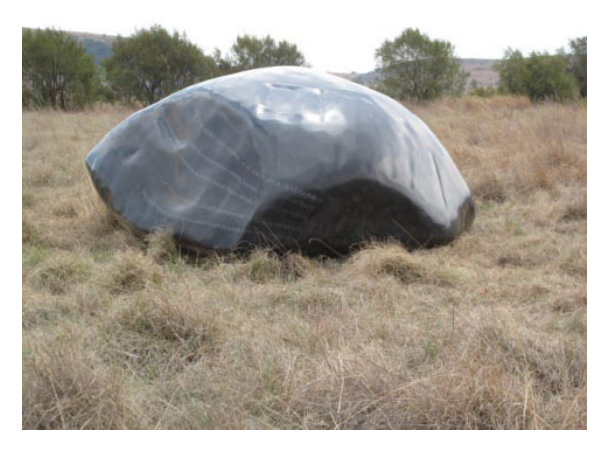
Figure 4 Calculus Moo

Syriac and Swedish, while Calculus Moo , (figure 4) is inscribed with Oriya, Herero, Amharic, Hungarian, Spanish, French and Northern Sotho (Boshoff 2009: 1).