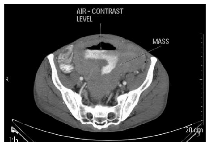
Fig. 1. Axial post-contrast CT, venous phase at the level of the pelvis, showing a large mass with central ulceration as well as contrast collection (1a) and an air fluid level (1b).