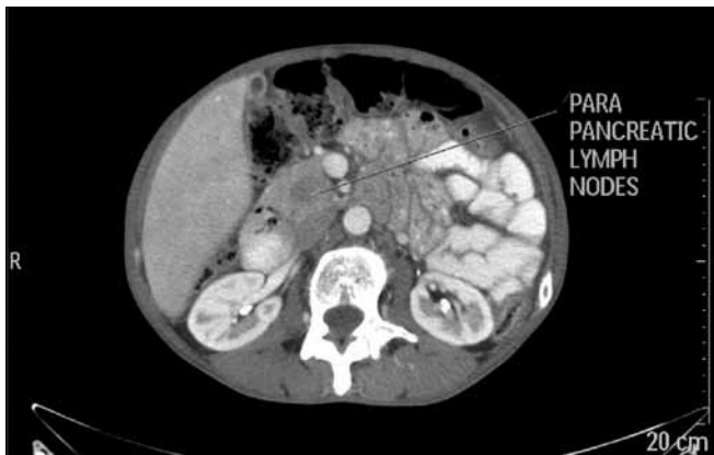
Fig. 3. Axial post-contrast CT scan, venous phase at the level of the kidneys, showing large para-pancreatic lymph nodes with central low density.

pain, dysphagia, small bowel obstruction, haematemesis and melena. Symptoms are usually identical to those caused by primary GI tumours. 4,6