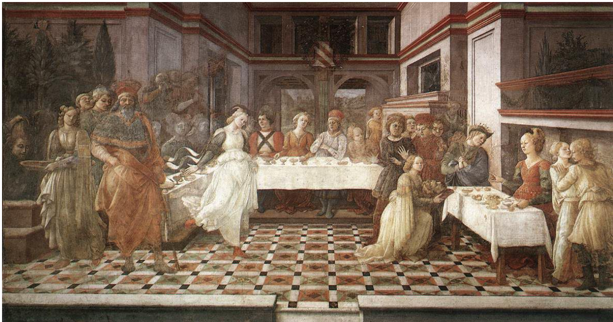
Figure 2 Filippo Lippi, Histories of Saint Stephen and John the Baptist: Salomé's Dance (XV century Cathedral of Saint Stephen, Prato, Italy).

A complete different meaning, although in the no verbal communication, belongs to some dances which are merely symbolic with animistic and fabulous figurations having their expression in classical ballets like “The Nutcracker, Swan Lake, Giselle, etc.”, whose important psychological fact is always the figurative expression of fantastic elaboration of the “primary thought” whose meaningful aspects are underlined and reinforced by music.