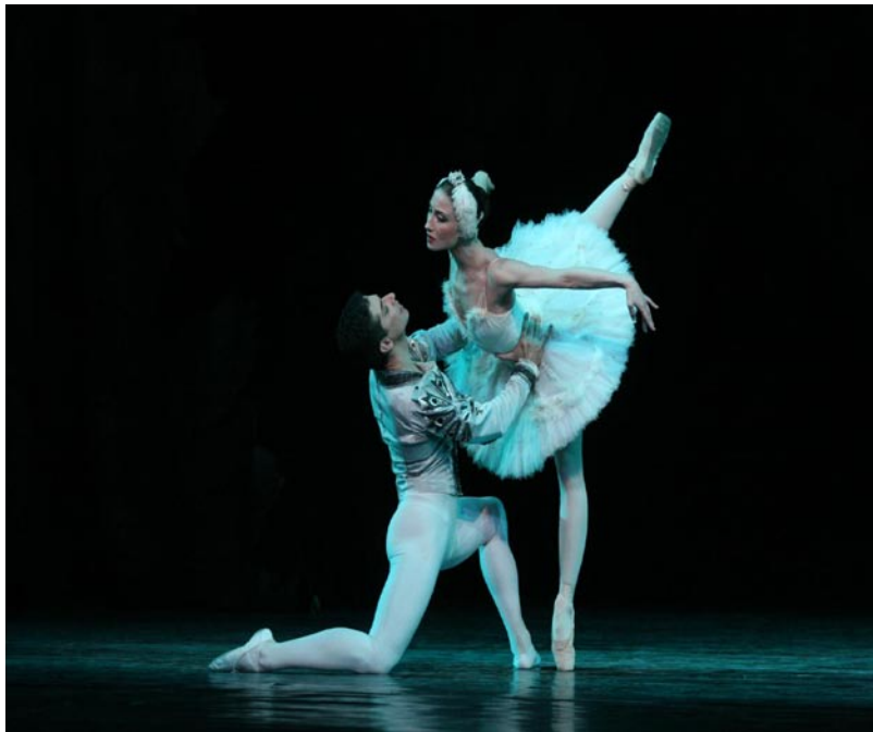
Figure 3 Petr Il'ic Čajkovskij, Swan Lake .

But it is clear that, just like the other forms of artistic message, the dance itself is affected by the social cultural and environmental conditions in which it develops itself and from which it becomes one of its expressions. In this way one can explain and understand the huge difference between dances with a high spiritual content such as the Shinto and Buddhist dances, and a ritual of simple violence such as primitive populations' dances like the Zulu's, Maoris' ones etc, and a propitiatory ritual such as the dance for raining and at last the splendid coral artistic creations such as "Swan Lake" in which the dance itself becomes a pure Eros' sublimation.