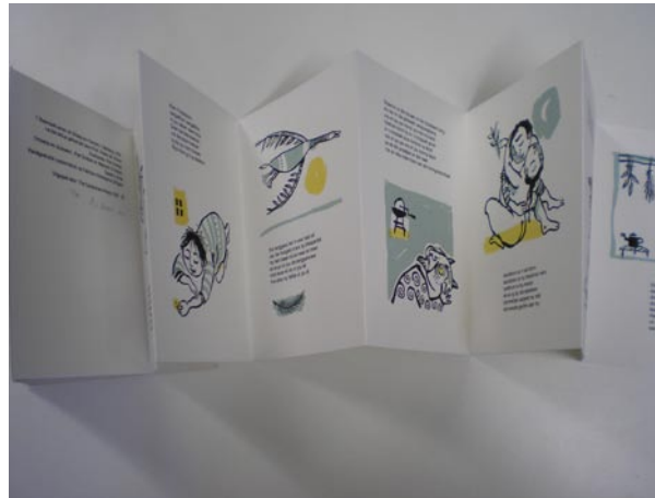
Figure 2 Piet Grobler 7 Boerneefgedigte (1997, screen printing, 15.5 x 20.5 x.7 cm, The Caversham Press).

An artist's book can also be produced as a printed edition which follows similar principles as in Piet Grobler's Boerneef poems (figure 2); or it can be an 'altered' book in which one or more artists alter a pre-existing commercially printed book; and in the age of electronic media and libraries, it can even take the form of an electronic book. Artists' books can also be collaborations, in which more than one artist work together to create a book, e.g. Cheryl Penn and Estelle Liebenberg-Barkhuizen's 1984/1994 (figure 3). Books can also be duplicated, hence becoming multiples of the same item. 3 It is important to note that the category 'artists' books', in its widest sense, includes a variety of books which range from artist's sketchbooks to books conceived and bound specifically by artists. According to arguments presented by most scholars and writers, artists' books are not only books containing works of art, such as sketch books: the book, with everything it encompasses, is the original work of art.