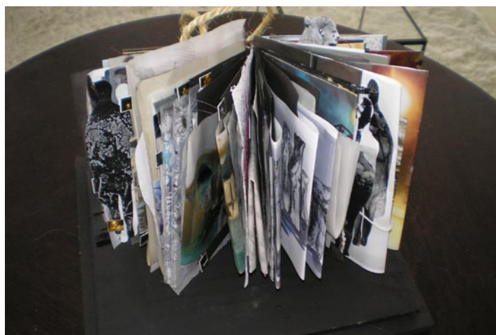
Figure 1 Cheryl Penn Night Crossing (2008, unique artists' book, multimedia, 19 x 33 x 23 cm, collection of the artist).

The field of artists' books is, as already indicated, a widely practised albeit recently established expressive creative phenomenon. It appears necessary, for the purpose of this article, to present a broad description of what is meant by 'artists' books' before proceeding to a discussion of them within a postmodern context. The diversity of artists' books being made, both locally and overseas, and inevitably also their postmodern disposition, are the factors which have rendered a single definition impossible. However, for the purpose of an introduction to this article, and to clarify aspects of the nature of the objects under discussion, artist's books can broadly be described as any book made or altered by an artist, either as a single, unique work or as an edition, in which the concept of the work cannot be visualised and materialised in any form other than in book format. 2 In an artist's book, content, image, binding, structure and chronology merge into an interrelated object, which is either a unique object (i.e. a 'one-off') or can be presented as an edition. A unique book, made by an artist or by a collaboration of artists, writers and binders, usually has works of art with or without text, assembled in such a way to resemble, or function as, a book. In Night Crossing (figure 1), a unique, altered book, Cheryl Penn combines writing, visual imagery and collage to tell a story about going to sleep and entering the world of dreams.