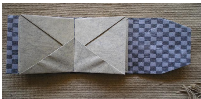
Figure 5 Hedi Kyle Pocket book (2008, 13 x 8.5 x 1.5 cm, collection of the author).