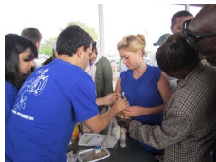
Students vaccinating a dog at Loate CVC