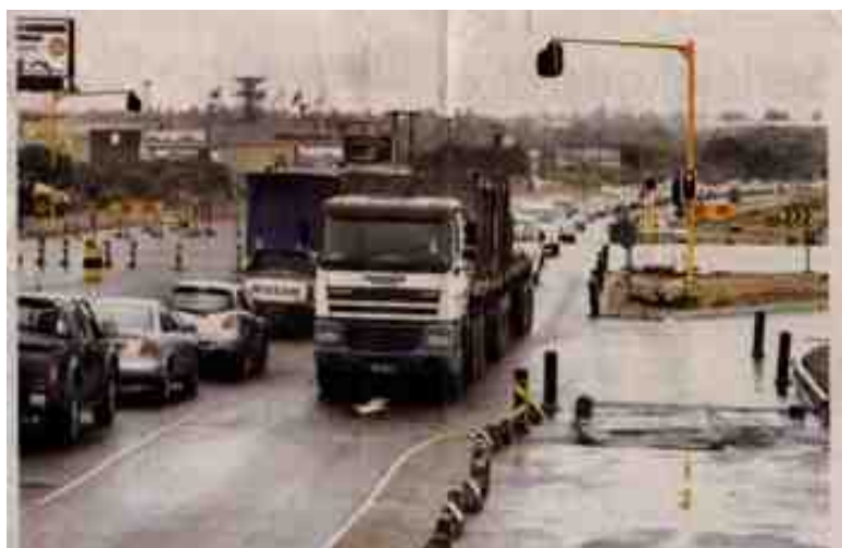
Figure 3.0- Traffic congestion during construction of Molapo Crossing/Metsimotlhabe Road.