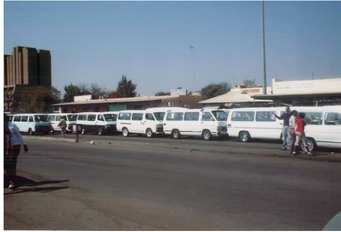
Figure 8.0 – Mini buses at the old Gaborone rank

The deficiency of these low capacity vehicles as mass passenger transporters is apparent. For example, they carry number of commuters they carry per kilometre of travel is limited. On the other hand, acts of careless driving and wanton disregard for traffic laws by some mini-bus drivers exacerbates traffic congestion problems and impact negatively on road safety. Public transport infrastructure is inadequate and unattractive as can be seen in Figure 9.0