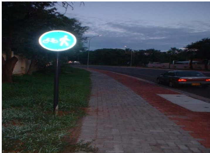
Figure 4.0- North Ring Rd, Gaborone (note NMT facilities)

Traffic congestion erodes the general level of safety for pedestrians and has the effect of stunting walkability. In Gaborone, there is a general inadequacy of traffic calming measures near schools, and 'home zones'. This discourages many people from walking for fear of being involved in vehicular/pedestrian accidents. Presently, cycling and walking represent only 0.20% and 30.30% of trips in Gaborone respectively (Greater Gaborone Multimodal Transport Study Report, 2008). In addition, it is apparent that cycle paths and pedestrian side walks in Gaborone are inadequate in various respects and to some extent, sporadic. What is available in Broadhurst or Gaborone West is not necessarily available in Bontleng or White City areas and the dissimilarities in Figures 4.0 and 5.0 below are apparent.