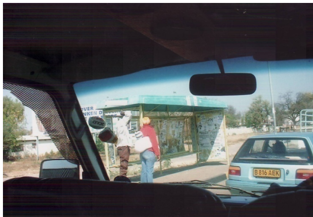
Figure 9.0: A typical bus shelter in Gaborone

The deficiency of these low capacity vehicles as mass passenger transporters is apparent. For example, they carry number of commuters they carry per kilometre of travel is limited. On the other hand, acts of careless driving and wanton disregard for traffic laws by some mini-bus drivers exacerbates traffic congestion problems and impact negatively on road safety. Public transport infrastructure is inadequate and unattractive as can be seen in Figure 9.0