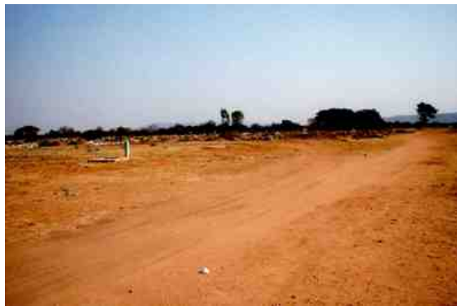
Figure 10.0- A disused dumping site just outside Mogoditshane.

Secure parking facilities with attendant amenities should be built on the periphery or outskirts of the city. The disused dumping site in Figure 10.0 below is situated next to the Gaborone/Kanye road and can be rehabilitated for park n' ride services into the conurbation of Gaborone. To further enhance patronage of these services, planners should ensure that future designs for new roads include dedicated lanes for the so-called high occupancy vehicles (HOVs) as this measure is bound to improve average bus journey times.