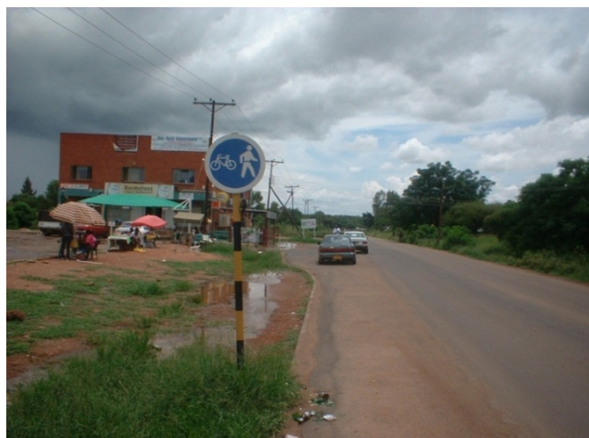
Figure 5.0- A road in Phase II area, Gaborone (note the disparities)

The current setting does not provide a consistent picture of a harmonized approach to provide these facilities across the breadth of the city, and the scenario is rather of a divergence between land use planning and transport planning. For instance, open storm