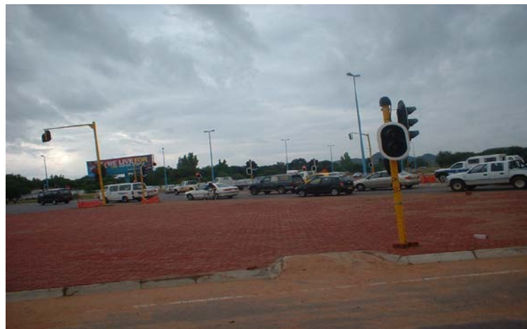
Figure 2.0: Traffic at the so-called Btv Circle, Gaborone.

Traffic congestion is relatively simple to recognize as it is characterized by roads filled to capacity with vehicles, and side walks teeming with pedestrians. However, in the transportation parlance, congestion refers to “an excess of vehicles on a portion of roadway at a particular time resulting in speeds that are slower-sometimes much slower-than normal” (FHWA, USA, 2006) or “a physical phenomenon relating to the manner in which vehicles impede each other’s progression as demand for limited road space approaches full capacity” (OECD/ECMT Report, 2007). The daily traffic jams on Botswana’s urban roads, Gaborone in particular, are common to all car users. Gridlocks on the Wellie Seboni Road which intersects with Nelson Mandela Drive in the east and connects to the so-called Btv traffic circle in the west, right through part of Mogoditshane; Gaborone/Molepolole road and the Gaborone/Kanye road at both morning and afternoon rush hours, are typical examples of congested roads. Figure 2.0 shows typical road traffic congestion along Wellie Seboni Road.