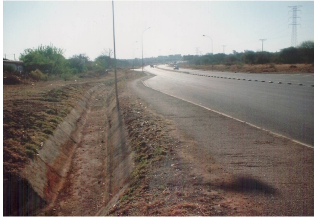
Figure 6.0: An open trench along Wellie Seboni Road, Gaborone

water trenches running alongside main roads as illustrated in Figure 7.0 render it impossible for the City Council to provide facilities for cycling and walking. Open trenches can also aggravate the severity of injuries in event of a road traffic accident; therefore, covered pipes could be more ideal as the land above can be conserved and utilized for facilities mentioned earlier.