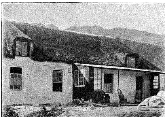
"Patmos," Kalk Bay.