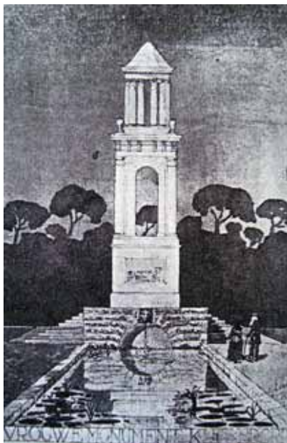
Figure 1 Klerksdorp Women's Monument, design presentation (Moerdijk 1921:164).