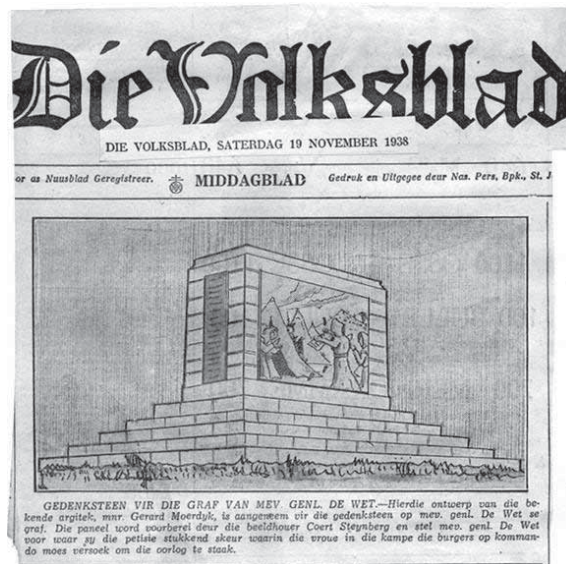
Figure 6 Design for a tomb for Mrs Cornelia de Wet as it appeared in Die Volksblad on 19 November 1936. ( http://repository.up.ac.za/upspace/bitstream/2263/258/1/MDK0293T ).

A design for a monument by the hand of Moerdijk was unveiled posthumously in 1963 to commemorate the life and death of Antjie (Anna) Scheepers (1806-1878) (Pretorius 1989: 84-5), illustrating Moerdijk’s all-encompassing sway particularly on the architecture of Afrikaner Nationalism (figure 7), even after his own death. Again the grave is relocated from where she had lain buried on the farm of her son ‘Welgevonden’ near Vryburg, Kwa-Zulu Natal. It was rediscovered in 1939 and her remains disinterred to lay beneath the monument of Moerdijk’s design incorporating a roundel sculpted by Laurieka Postma (1903-1987) (Duffey 1993: 50-7), in the grounds of the then Afrikaans High School at Ladybrand, Free State, erected from funds raised mainly by pupils of the then Orange Free State (Van Rensburg 1977: 731). The bronze roundel had already been sculpted and cast under supervision of the artist in 1947 but remained unplaced all those years until a suitable location for it could be found. It depicts an episode from the diary of Louis Tregardt (Trichardt) (1796-1838) in which Antjie Scheepers, Martha Tregardt 18 and Breggie Pretorius 19 (1810-1889) direct the Trekker men-folk - who were in despair of ever traversing what seemed an insurmountable Lebombo Mountain barrier - to the route the women had discovered where the wagons could be taken down the mountain (Pretorius 1989: 85).