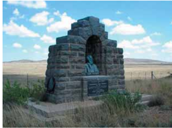
Figure 4 Louw Wepener memorial, Bethulie District (Clarke: 2008).

A bronze bow-topped bas relief plaque matching the niche containing the life-size bronze bust in front, both sculpted by Coert Steynberg (1905-1982), depicts the assault on Thaba Bosigo with the inscription 'Getrou tot in die dood' 13 . A second cast of the bust is to be found in the town of Wepener in the eastern Free State, erected in 1965, the shoulders and full chest omitted from its casting, the bust mounted on boulders removed from a site at Thaba Bosigo proximate to where Wepener was first buried (Geyser, 1989: 82-3).