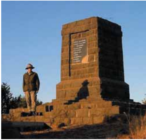
Figure 3 Elandslaagte memorial, Ladysmith District ( http://www.battlefieldsregionguides.co.za/Boer%20War.htm ).

Hier rus die stoflike oorskot van Kommandant Louw Wepener (1812-1865) die onverskrokke held van die tweede Basoetoe-oorlog wat sy lewe gegee het op Thaba Bosigo en sy jeugdige strydmaakker Adam Raubenheimer (1840-1865) wat van Oudshoorn alleen te perd gesnel het om die Vrystaters in hul stryd te help. 12