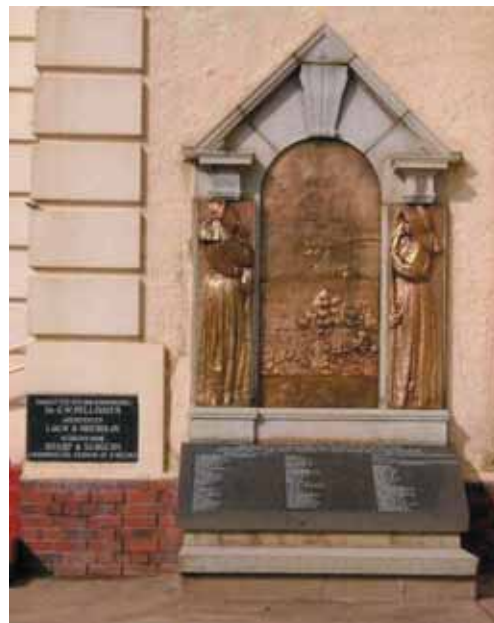
Figure 2 Talana memorial, Dundee (Clarke 2009).

From his writing it is evident that by 1920 he had already been commissioned to design a memorial for the town Klerksdorp, commemorating the sacrifice of women and children in their