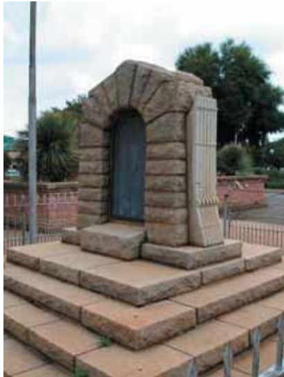
Figure 5 Voortrekker centenary monument, Middelburg, Mpumalanga. (Clarke: 2008).

the petition requesting their husbands to lay down their arms. The moment depicted on the grave is when Mrs de Wet with the women watching tears apart the document in scorn saying “Sal ons die Burgers vra om oor te gee? Nee, nooit!” [Will we request the Burgers to admit defeat? No, never!] 17 , words recorded on the end of the grave. Architecturally, the grave is of the simplest, a rectangular form of a single coursing of rough-hewn ashlar blocks to create the niches for the bronze panel and inscriptions.