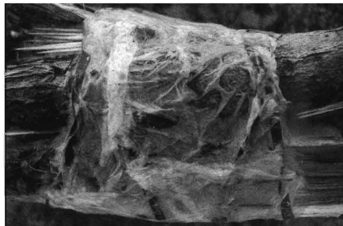
Close-up of firewood bundle

Traditionally, a plinthe or base, was, and still is, used to elevate an art object, to set it apart from its surroundings. With the mud and cow-dung rectangle that constituted the ziggurat's plinthe, it was not my intention to comply with or contest this tradition.