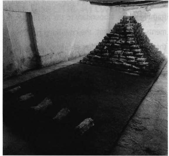
Close-up of firewood bundle

Against the parsonage, the ziggurat was used on the one hand, as a metaphor for nature (a human made Compasberg) reflecting what I perceive as nature's interdependence and patterned irregularities; and on the other, in its pyramidal shape, a means of liberally imaging a philosophical contrast and its ideological derivatives. Simply put: the ziggurat refers to nature; while the pyramid refers to Plato 1