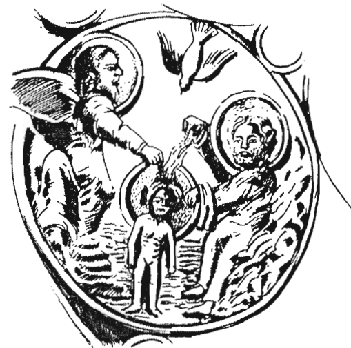
Figure 5. Baptism of Christ and other Gospel scenes. An ampulla, Monza, Treasury of the Colegiate of St John (Mâle 1987: 74)

This evokes the question: which representation of the Baptism included the first angel present on the bank of the Jordan? Alternatively, it could be asked if the inclusion of such an angel (or angels) - like certain scientific discoveries - occurred simultaneously in various places after the publication of Pseudo-Dionysius's Hierarchia celestis ? The answers to these questions are difficult to establish. Whatever the case may be, Mâle calls the inclusion of the figure of an angel an "astonishing innovation", a landmark in the history of the representation of the Baptism. The artist who first ventured to change the iconography of the Baptism scene was truly original. Thereafter, the scene