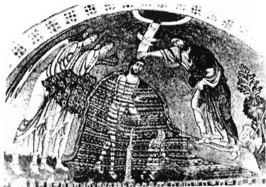
Figure 1: Baptism of Christ , Delphi, Katholikon of the Monastery of Hossios Lukas (Lavin 1981: 20)

A further most symbolic aspect of Baptism scenes is the emphasis on water. It is evident that water imagery is central to baptism by immersion, as practised by the early church. Therefore the immersion of Christ in the Jordan's water receives great emphasis in the various depictions of the scene, for example in the Baptism of Christ , a Byzantine mosaic representation in the Monastery of Hossios Lukas (figure 1).