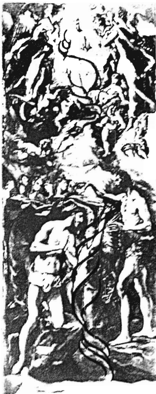
Figure 7. El Greco, Baptism of Christ , diagrammatically emphasising the spiral forms of the field of force of the main angelic figure. Madrid, Colegio de Doña Maria de Aragon (Wethey 1962: figure 113)

El Greco achieved his original vision, not by the extension of existing ideas about the Baptism scene and especially about angels, but I postulate that El Greco composed this late Baptism scene to express the Neoplatonic idea of Marcilio Ficino (1576) literally, that beauty is a radiance from the face of God,