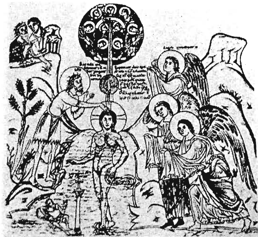
Figure 2. Herrad von Landsberg, Hortus deliciarum (Copy of original, Schiller 1971: figure 364)

according to the Hierarchia celestis postulated by Pseudo-Dionysius the Areopagite (1976).