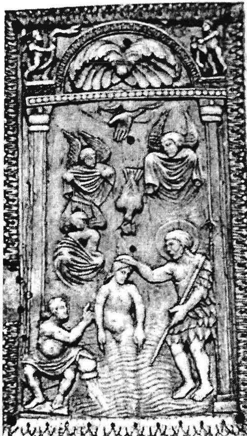
Figure 3. Liuthard Group (Schiller 1971: figure 366)

in baptism scenes until the eleventh century Christ regularly stood unclothed in the water in frontal pose with his arms hanging by his sides. Very little attention is paid to correct anatomy. Some representations explicitly emphasise Christ's divine nature by the inclusion of a mandorla or vesica pisces . Landscape details are generally excluded. Christ usually stands in a "mountain of water" which rises to cover his body to the waist in a decorative ripple. In contrast to the nudity of Christ the figures of angels are decorously dressed and draped like deacons.