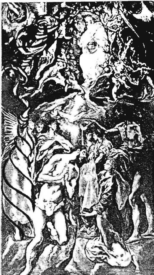
Figure 8. El Greco and Jorge Manuel, Baptism of Christ , diagrammatically emphasising spiral forms and the field of force of the main angelic figure. Toledo, Hospital of San Juan Bautista de Afuera (Wethey 1962: figure 135 )

enlightening first the angels, then the human soul, and lastly matter. 4 Beauty, therefore, is achieved by a victory of divine reason over matter. Ficino's insight, based on that of Pseudo-Dionysius, denotes a victory of the metaphysical world over the phenomenal world, noticeable in El Greco's work in which the landscape setting is barely suggested while the figures represent the hierarchy of radiance or grace described by Ficino.