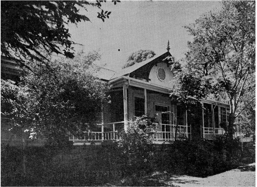
The Smuts House, Doornkloof, Irene.