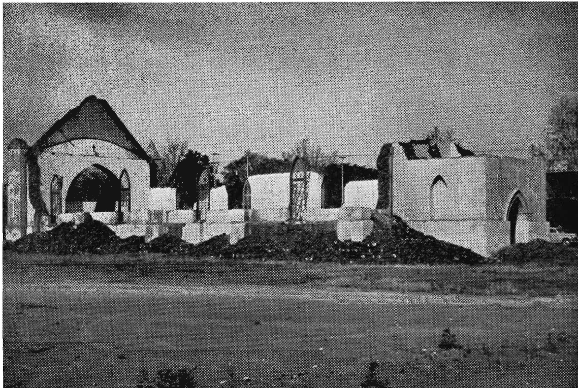
Die lêë mure van die Duitse sendingkerk te Skoolplaats, Boomstraat. Die kerk is omstreeks 1870 gebou en in 1953 gesloop om plek te maak vir busskure.

The empty shell of the mission station in Boom Street. It was built in 1870 and demolished in 1953.