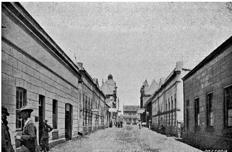
Aasvoëllaan in 1904.