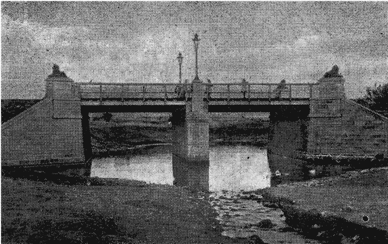
Die Arcadiabrug ongeveer 1902. Argitek: Sytze Wierda. The Arcadia bridge, circa 1902.