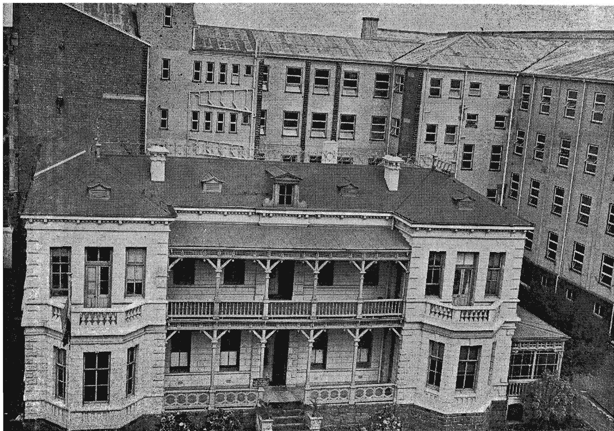
Die historiese Z.A.S.M.-gebou, hoofkwartier van die Nederlands-Suid-Afrikaanse Spoorwegmaatskappy kort voordat dit in 1958 gesloop is. The historic Z.A.S.M. building in Paul Kruger Street just before it was demolished in 1958. It was the headquarters of the old Netherlands-South African Railway Co. The site is today the headquarters of the Department of Bantu Administration and Development.