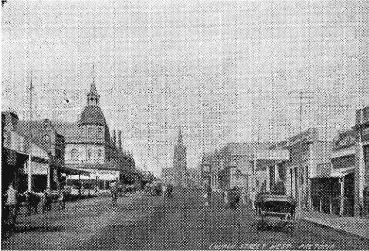
Changing Pretoria. Church Street East, 1906. Pretoria staan nie stil. Kerkstraat-Oos, 1906.