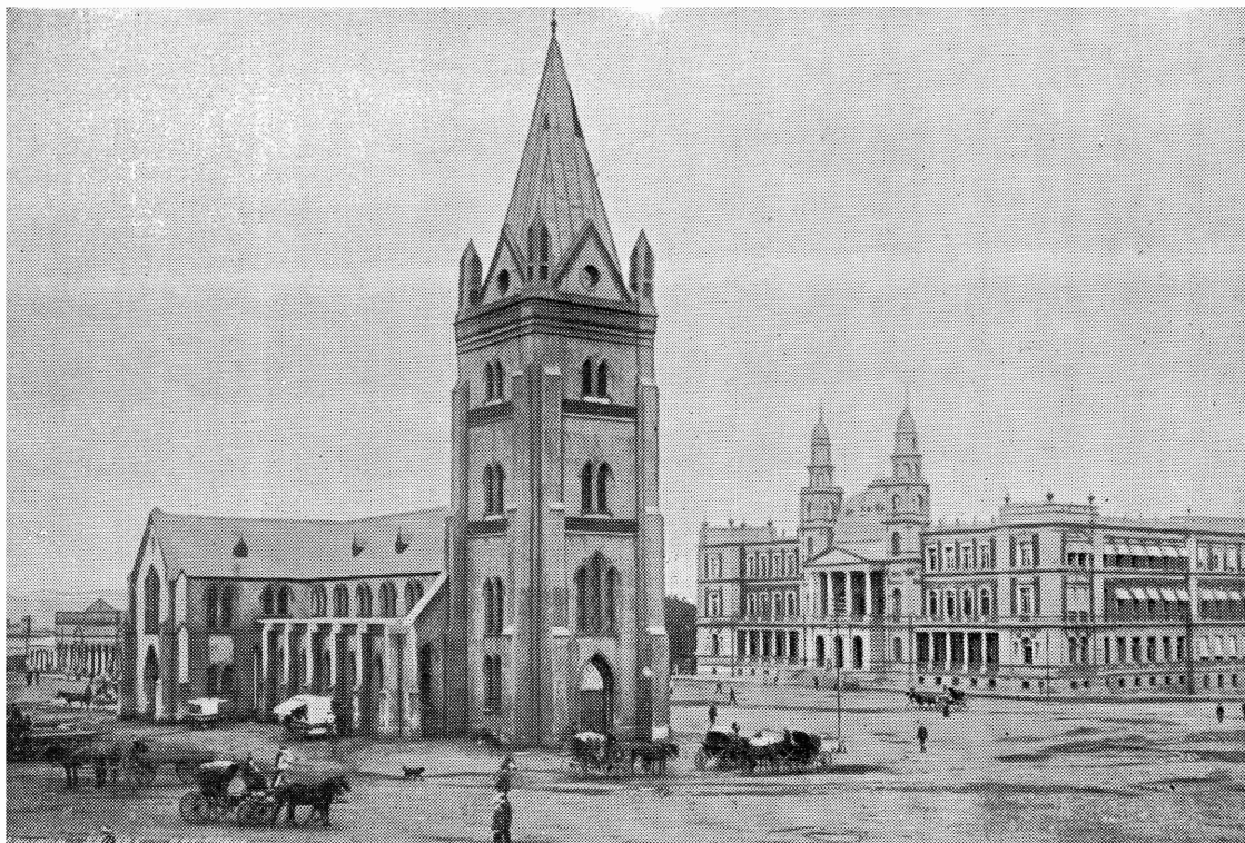
CHURCH SQUARE ± 1904