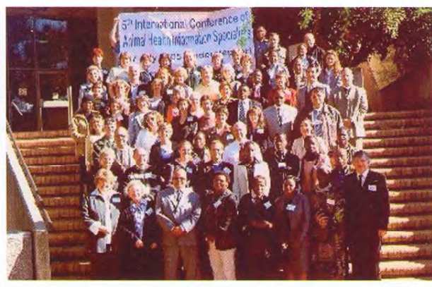
Participants in the 5th International Conference of Veterinary Librarians (2005)

Feedback received from participants showed that the eight-day programme, consisting of four spent on formal presentations, poster sessions and tours, and four devoted to pre-conference workshops, was very successful. The Veterinary Librarian of the University of Illinois, USA, inter alia said: 'Bridging the information gaps in animal health, along with establishing enduring contacts between information professionals in service to the profession, were the goals of the conference, and by all levels of expectation, they were met, setting the stage for future ICAHIS endeavors.'