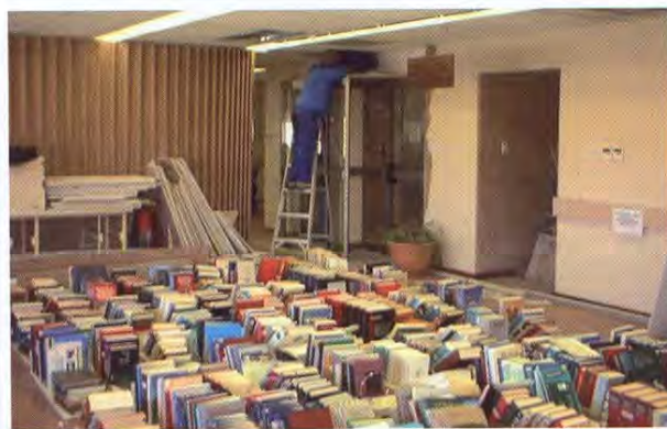
Books on the move to the new library