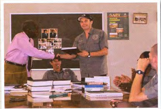
Presenting of books to the Veterinary School in Zambia

Our project Veterinary Books for Africa enlisted the help of the student community since 1993 when we started it. In that year two students took books and journals by bakkie (light commercial vehicle) to the veterinary school libraries in Zimbabwe and Zambia. In the past decade it has grown to become a full component of the students' outreach programme, with a trip undertaken every two years by a group of six to eight students. They raise the funds and are responsible for all the logistics. In this way we are helping to improve the information collections of other veterinary libraries in Africa.