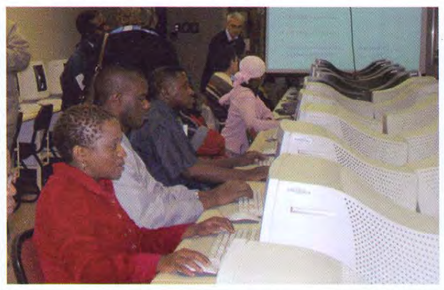
Conference participants in the computer laboratory

by 65 participants, most of them representing 30 veterinary libraries or institutions from Africa, Europe, Australia and the United States. Since this was the first time that this conference was taking place on the African continent (the former ones were held in the UK (at Reading and London), Denmark (Copenhagen) and Hungary (Budapest)), participation from other African nations was especially encouraged. Thanks to support from the Technical Centre for Agricultural and Rural Cooperation (CTA), Wageningen, The Netherlands, seven information specialists representing Uganda, Tanzania, Mozambique, Nigeria, Zambia and Zimbabwe were able to attend and deliver papers at the conference.