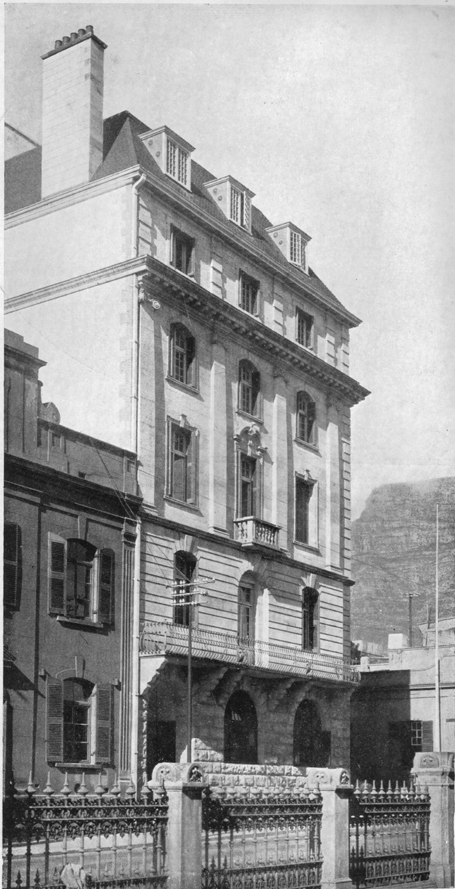
BUSINESS PREMISES, PARLIAMENT STREET, CAPE TOWN BAKER AND MASEY, FF.R.I.B.A., ARCHITECTS