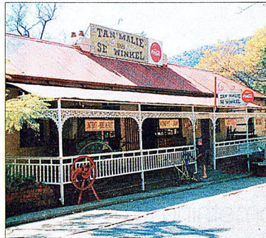
A perfect weekend includes lunch at 'Tan' Malles near the Hartbeespoortdam.