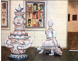
□ Art works on show at the Pretoria Art Museum, one of the city's main attractions.