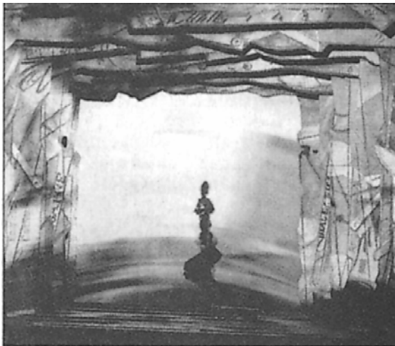
Figures 2—4 Three scenes from Black Box/Chambre Noir , showing how the video projection in this miniature theatrical projection is being treated as a sculptural object, integrating very cleverly and unobtrusively with other kinetic sculptural objects, stage décor and drawings, the moving mechanized figures and their cast shadows, as well as stage lighting.

Kentridge does not seem to have ever offered his films for consideration in terms of film as genre or discipline. These films can be conceptualized as artworks, even though the boundaries between art as film and film as art are often blurred. The sense of an articulated individualism and experimentation with new cinematic forms, as a manner of opposition to established genres, can be regarded as a remarkable achievement by the artist. 18 The British writer, Anthony Burgess, has classified films in two categories, namely those with Class 1