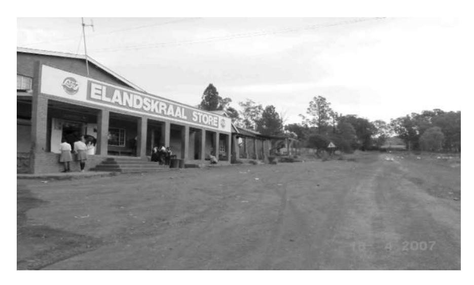
Figure 3 One of the few surviving stores in its entirety- note the imposed parapet and veranda (Author: 2007)

Internally, there appears to have been no standard planning format for stores initially, merely the provision of a space from which to trade. The trading floor within the shop was a large open area, often with a wide timber counter running around the three sides which sometimes included the entrance. One informant described the wide yellowwood counter in her store as being "golden with the fat of a thousand arms" <sup>10</sup>. Each item that was sold in the store had its specific position, whether it was jammed into a barrel, or shelved according to a hierarchy. In the larger stores, a specific person dealt with specific items, the sale of cloth being an example. Dry goods such as 'Government' sugar and flour and tobacco occupied large bins, from which scoops would be taken for measuring. High level windows left as much available room for shelves as possible, and it was certainly not uncommon to hang items from the rafters. Savage notes in his occasional paper that the stores owned by African people were smaller than those owned by Europeans, but that the format was really much the same.