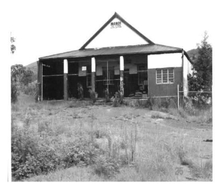
Figure 4 Mondi Store, near Creighton, now closed

The stores were unadorned, simple structures that expressed their function with architectural honesty. Few of them were decorated with the gentrified frippery such as fretwork and decorative bargeboards that characterized the architecture of the late Victorian and early Edwardian period at the end of the nineteenth century in the urban areas. Rather, decoration, which did arise as an unconscious development, came as a result of the advertisers plying well-known brand names.