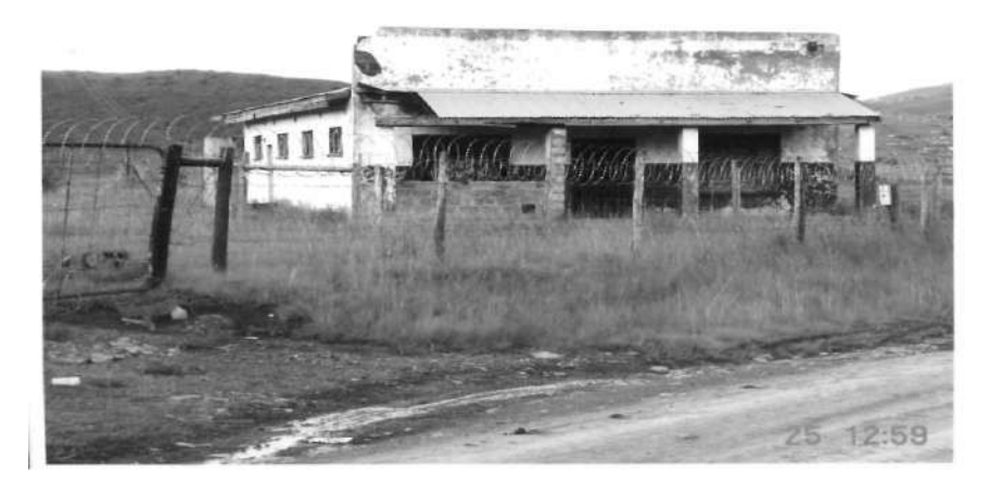
Figure 7 A deserted store near Sweetwaters

Another change in the material fabric of the stores, as a result of changing crime levels, was the new requirements for enclosure and barricade. Stores, particularly those that ran as spaza shops, began to barricade themselves in behind gates and bars, serving people through hatches. Sometimes these barricades reached all the way to the ceiling, but usually they were just the height of a door. Either way, this need to enclose is indicative of the perceived wealth and target value of the owners of these institutions, as much as a marker of the levels of crime in the new South Africa<sup>23</sup>. Not all of the stores are barricaded, and those that have been victims of hold ups, or those that are on the spaza 'end' or the supermarket 'end' often have drastic security measures. Many store owners that have operated for decades and have visible relationships of reciprocity between themselves and members of the communities that they serve, have no physically barring security, but instead rely on their social currency as well as the employment of security guards from the local community that ensure the safety of their central facility