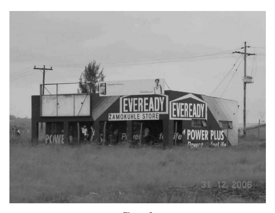
Figure\ 5 \\ 'Eveready'\ shouts\ across\ the\ landscape-\ near\ Amatikulu,\ (Author:\ December\ 2006)

'Eveready' Batteries and 'Glen Tea' have begun to overtake the entire store itself, such that the whole store building becomes a board for the advertisement. Introduction of bright colour and bold figure has entered the landscape of not only the rural areas, but also the townships. No longer is Coca-Cola THE demure symbiotic symbol participant in the notion of the quietly positioned store. Nowadays, advertisement and building becomes aggressively vocal across the urban and rural landscapes. Helped in great part by the more prominent parapet form, the building evolved to present the space that called out for the advertising.