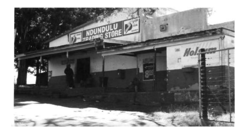
Figure 6 The landmark store at Ndundulu, near Melmoth

Another change in the material fabric of the stores, as a result of changing crime levels, was the new requirements for enclosure and barricade. Stores, particularly those that ran as spaza shops, began to barricade themselves in behind gates and bars, serving people through hatches. Sometimes these barricades reached all the way to the ceiling, but usually they were just the height of a door. Either way, this need to enclose is indicative of the perceived wealth and target value of the owners of these institutions, as much as a marker of the levels of crime in the new South Africa<sup>23</sup>. Not all of the stores are barricaded, and those that have been victims of hold ups, or those that are on the spaza 'end' or the supermarket 'end' often have drastic security measures. Many store owners that have operated for decades and have visible relationships of reciprocity between themselves and members of the communities that they serve, have no physically barring security, but instead rely on their social currency as well as the employment of security guards from the local community that ensure the safety of their central facility