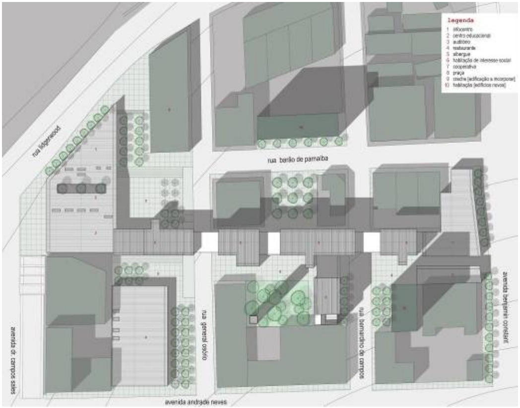
Figure 6: Implantation

This project is more than a suggestion; it is a study for strategies of occupation for urban voids. It articulates the disorganization of these urban residues - or their "informal organization" -, get circulations active, free possibilities of new actions: it is a strategy that can be used in other parts of the city, specially in the surroundings.