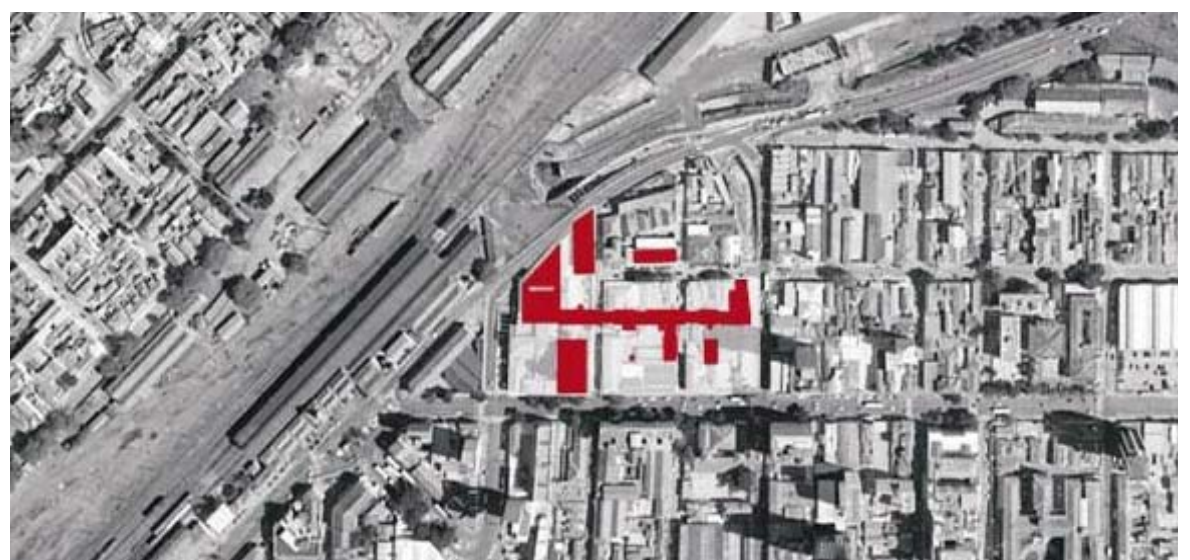
Figure 1: Aerial photo and infographic from the project

The development of architectural interventions in great cities opens up a debate about new forms of performance in urban space. The explosion of the so called "global cities", linked to an international net of economical corporations and stimulated by the transnational capital, breaks up the modern city. The "social apartheid" leads the city in two speeds and restructures man's surviving conditions: the "socially excluded" are willing to survive, while the "socially chosen" are supported by the redistribution of power in insurmountable walls: an overrigid distribution of capital and work.