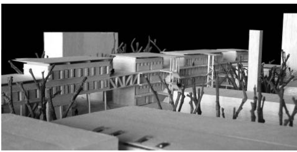
Figure 7: Model